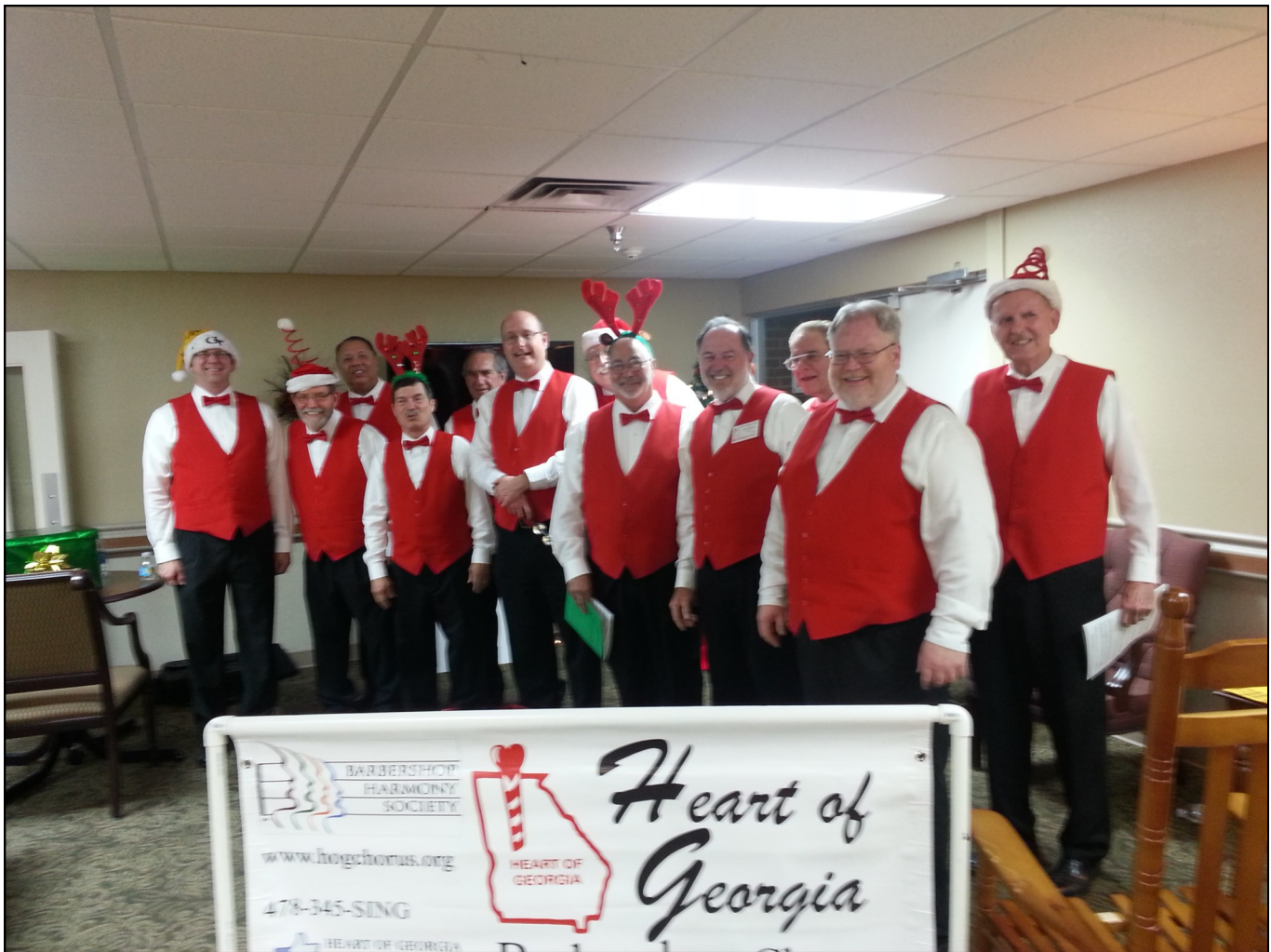
The Heart of Georgia Barbershop Chorus sang Christmas songs to the residents and staff at Warner Robins Rehab & Nursing Home.