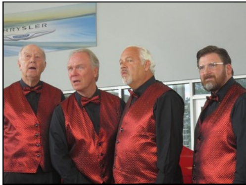
Five Seconds? Sure, we can do it in five seconds!

The ad-agency guy asked us to look as ‘barbershoppy’ as possible (where did I put that boater and striped vest?!?). I told him what we could do, and he said, “Okay, that’ll work”. The punch line is that the dealership guy says, “At Academy CDJR all you have to do is give us $49 down,” and the musical talent sings, “And pay the payment on the window!” The preceding taping had used an Elvis impersonator, and he sounded like he was saying the stereotypical “Thank you, thank you very much!” I put together a couple of tag ideas and came up with two alternatives – one 10 seconds long, and one 7 seconds long. After we sang both options, the ad-agency guys said, “That’s great. Let me hear the FIVE SECOND version now!” The 5 second version ended up being the 7 second option – sung really fast!