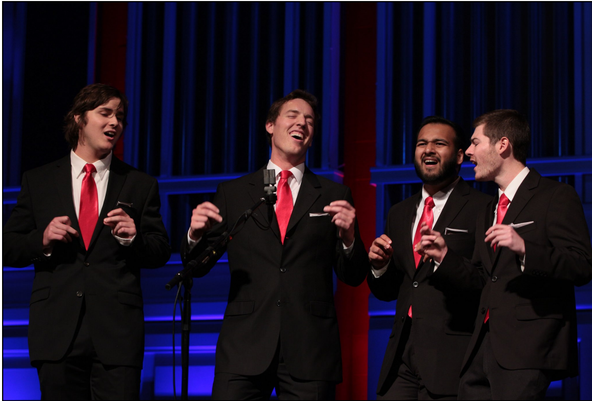
LOOP 10—72.4 College Quartet Contest