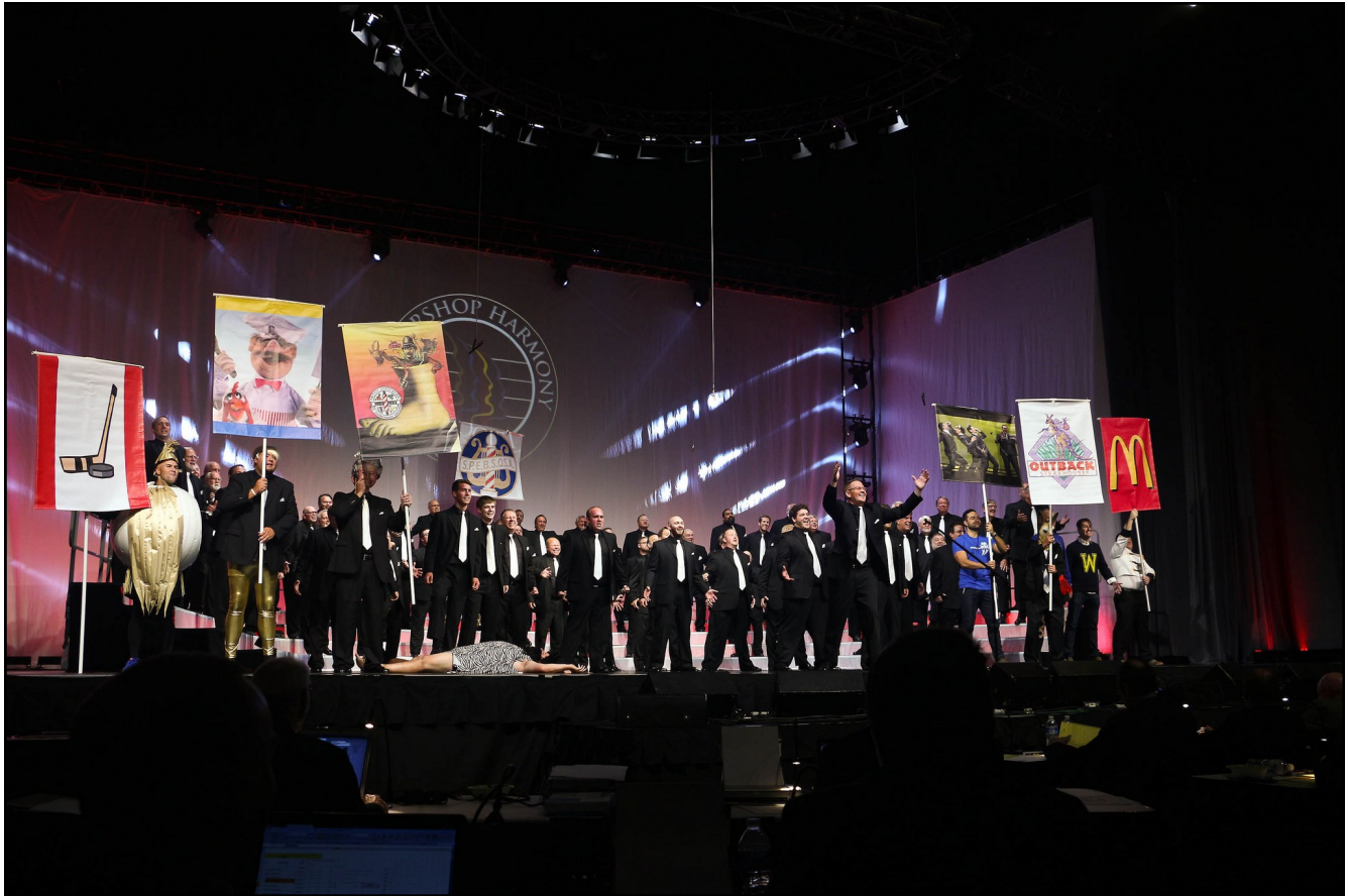
MUSIC CITY CHORUS, NASHVILLE CHAPTER FIFTH PLACE BRONZE MEDAL—89.7