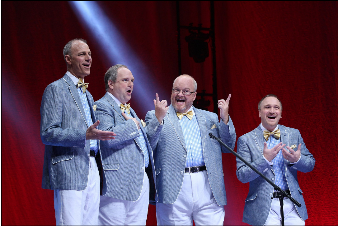
A MIGHTY WIND— 88.4