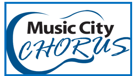
Chorus