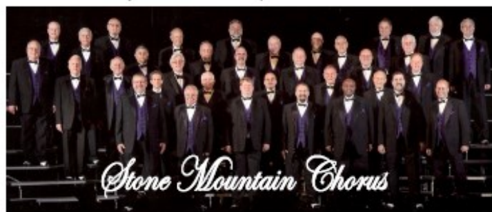
Stone Mountain Chorus

Barbershop Harmony from two Premier Choruses and their Quartets