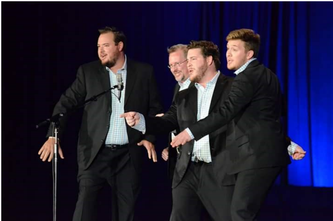
NOVICE QUARTET CHAMPIONS BAKER'S HALF DOZEN NASHVILLE, TN