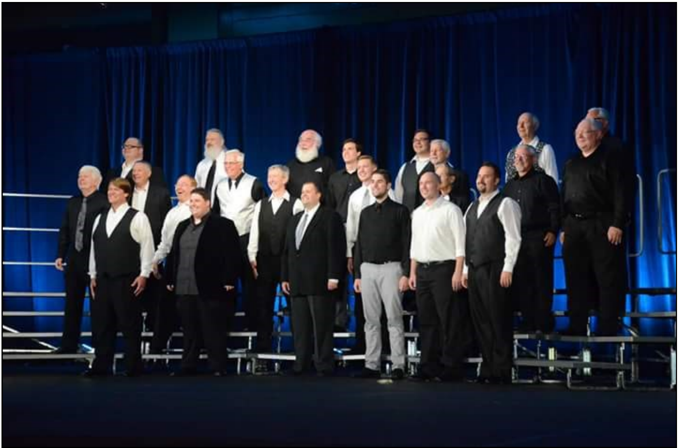
PLATEAU AA CHAMPION— SOUND OF TENNESSEE , CLEVELAND, TN