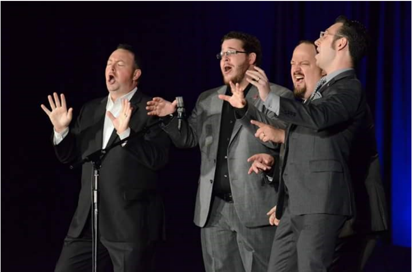
2015 DIXIE DISTRICT QUARTET CHAMPIONS GREAT AMERICAN SOUND MACHINE NASHVILLE, TN and ELIZABETHTOWN, KY