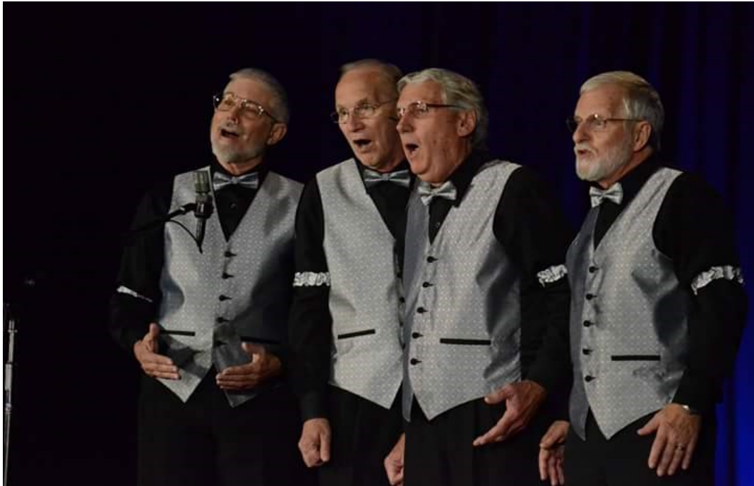
SENIOR QUARTET REPRESENTATIVES TO MIDWINTER SWEET TEA LAKE LANIER, GA