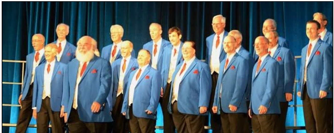
PLATEAU A CHAMPIONS and MOST IMPROVED CHORUS CHOO CHOO CHORUS , CHATTANOOGA, TN