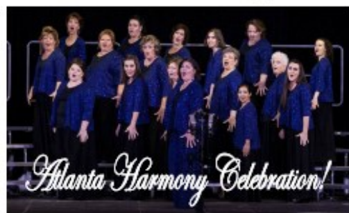
Atlanta Harmony Celebration!