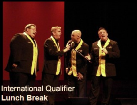
International Qualifier Lunch Break