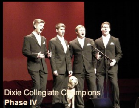
Dixie Collegiate Champions Phase IV Nashville, TN