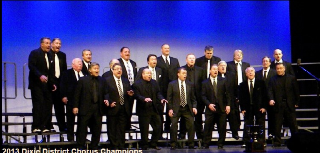
2013 Dixie District Chorus Champions RSVP Germantown, TN