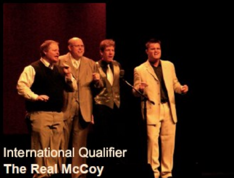
International Qualifier The Real McCoy