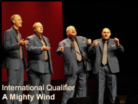
International Qualifier A Mighty Wind