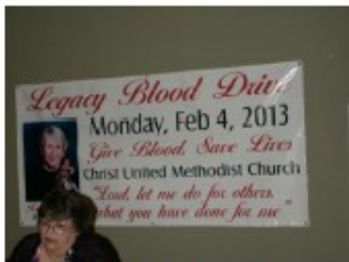
Dedicated to Betsy Steed

February was an active month for us. Our support church (Christ United Methodist) had a blood drive for which we always enjoy singing. One hundred and twelve pints of useful blood were collected during the drive.