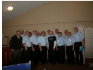
Vampire Man (Center)