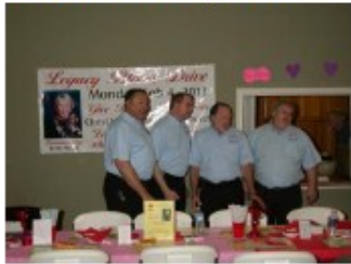
Quartet "Harmonic Balance"