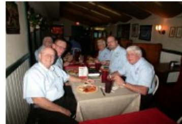
Me, in a picture (1 st on left) at Afterglow

Of course we had our "Singing Valentine's". Our two quartets sang for 36 folks. Samples, below.