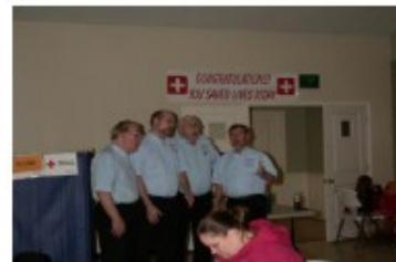
Quartet "Macon Harmony"