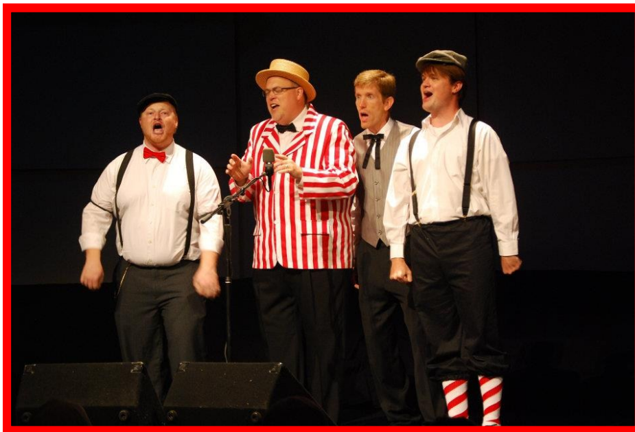
THE REAL McCOY 2012 Dixie District Quartet Champions

The Music City Chorus opted to sing for evaluation only, presenting a reprise of its 2012 international contest set which earned them a seventh place finish in Portland, Oregon in July.