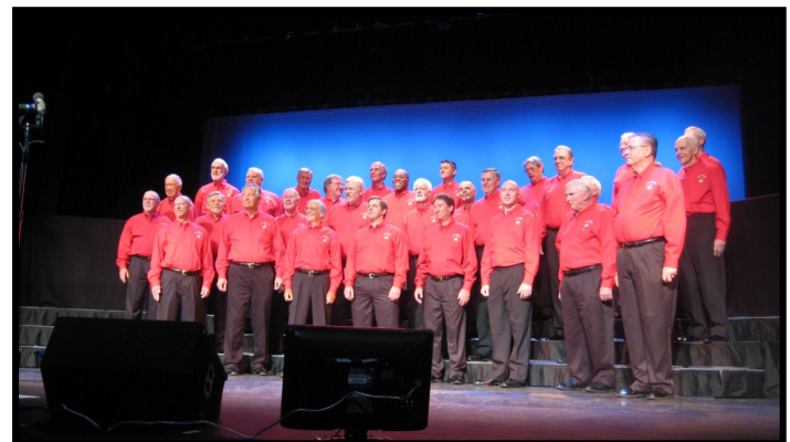
Big Chicken Chorus performing at the Grand Theater in Cartersville.