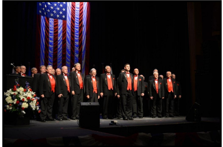
Big Chicken Chorus at Hearts for Heroes, The Strand Theater in Marietta.