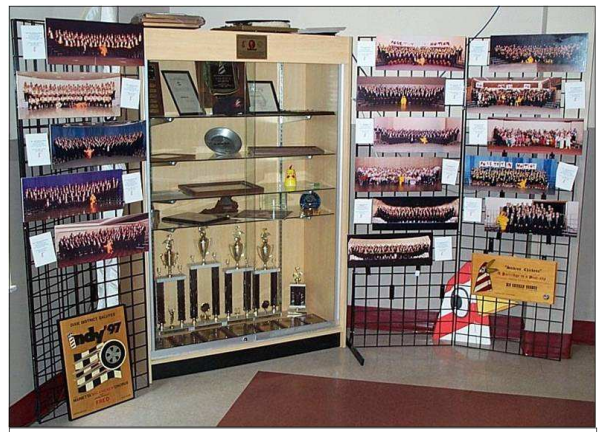
Jack Sweitzer Memorial Trophy Case