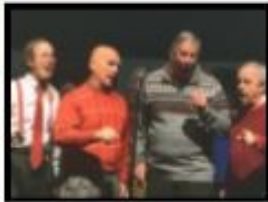
Time & Again