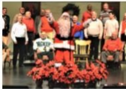
The Memphis Men of Harmony Chorus and Santa too!