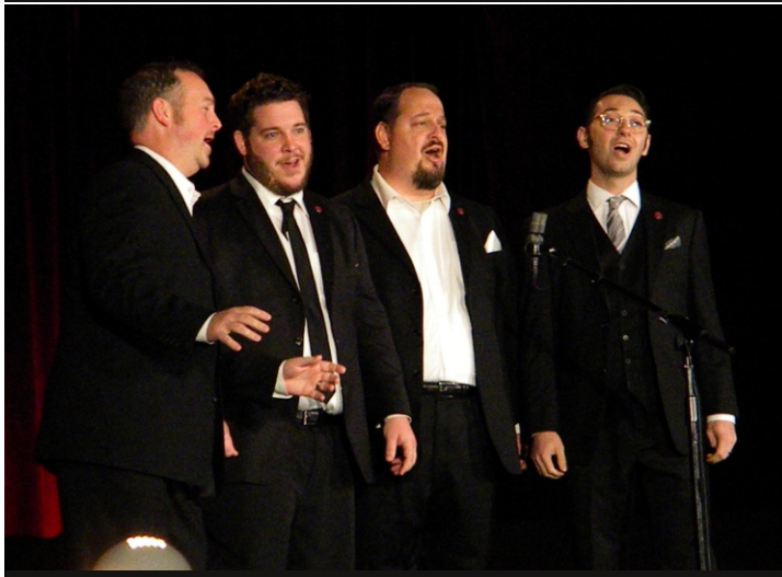
Great American Sound Machine Dixie Quartet Champion