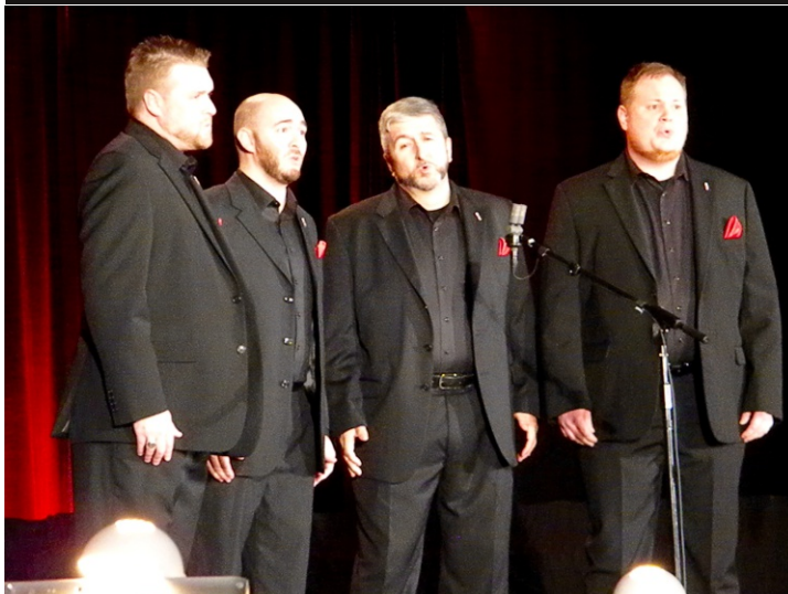
High Gravity - Fifth Place Quartet