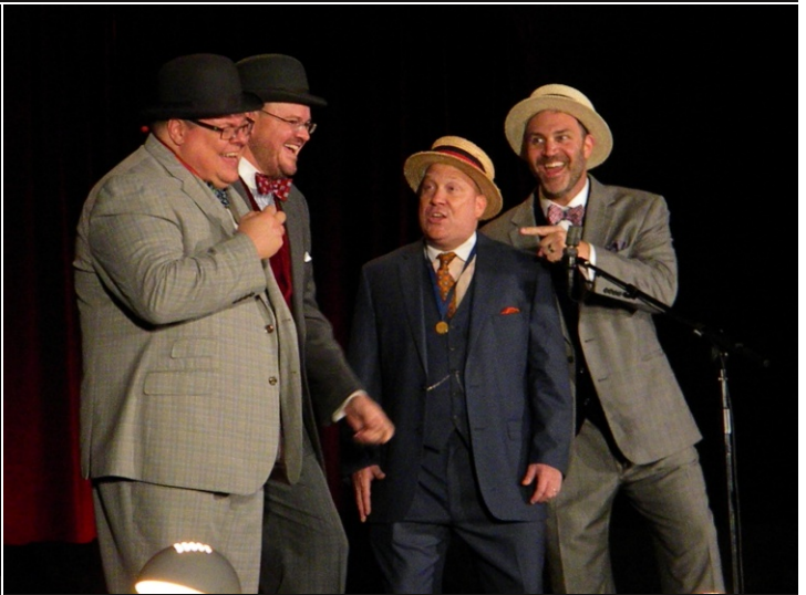
Boardwalk - Second Place Quartet