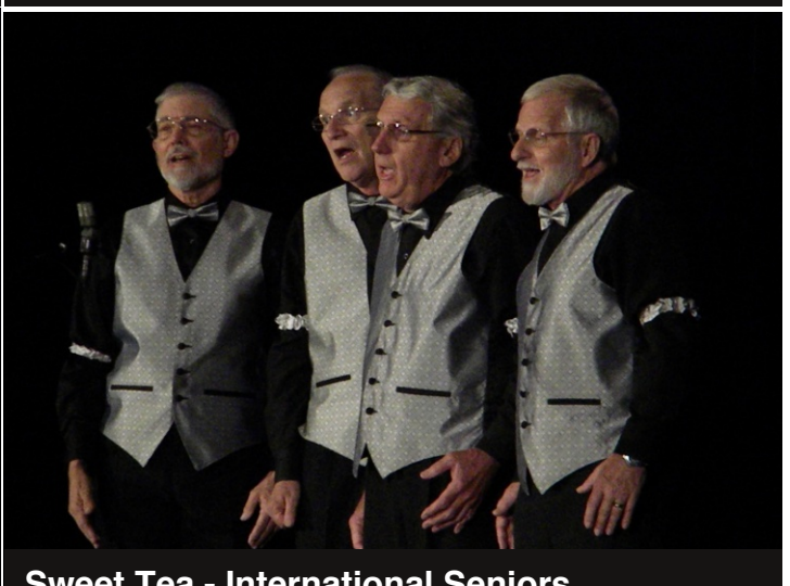
Sweet Tea - International Seniors Quartet Representative