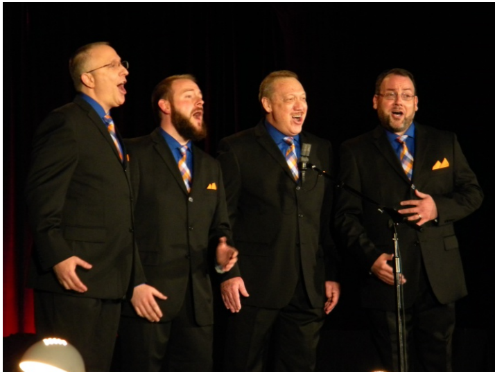
Prelude - Third Place Quartet