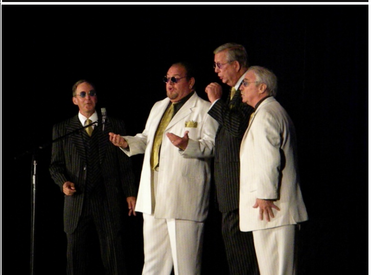
Time and Again - Seniors Quartet Champion