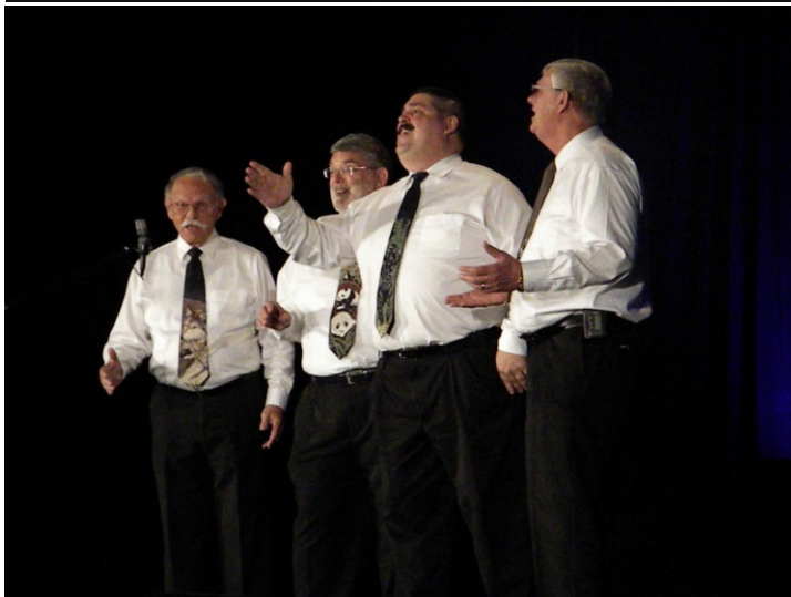
Three Nice Guys