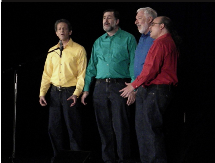
Four Bass Hit