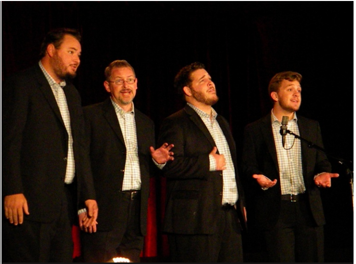
Baker's Half Dozen - Novice Quartet Champ