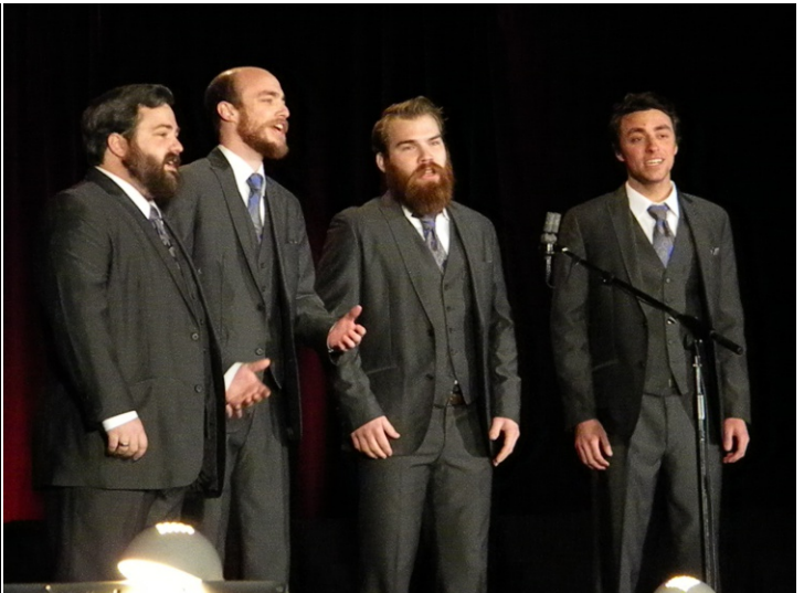
Instant Message - Fourth Place Quartet