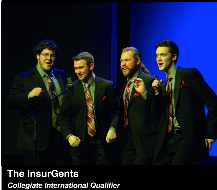
The InsurGents Collegiate International Qualifier