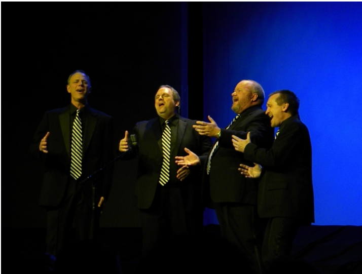
A Mighty Wind