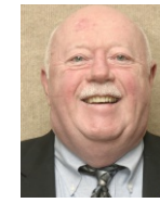
Communications Dwain Chambers