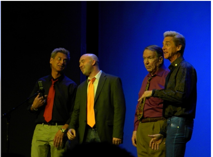
The "B" Team