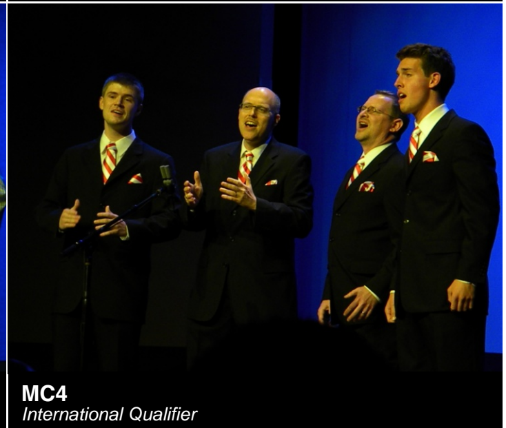
MC4 International Qualifier