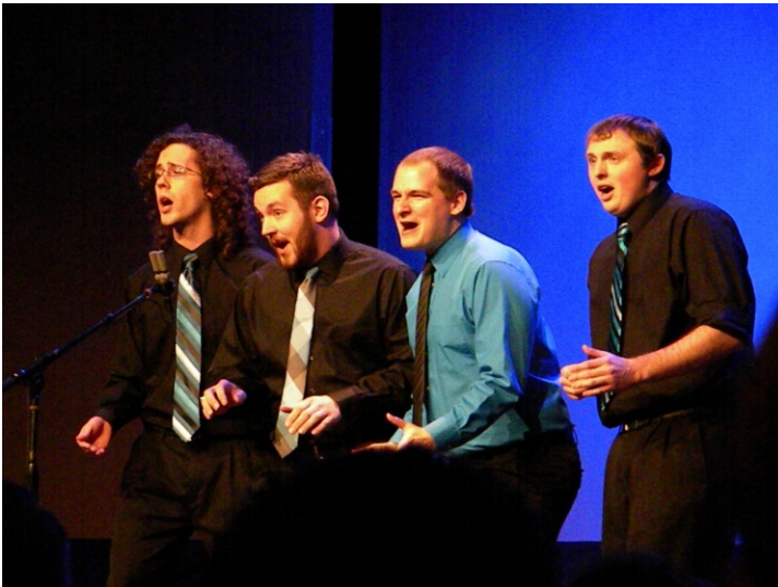
4 Score and 7 Chords Ago