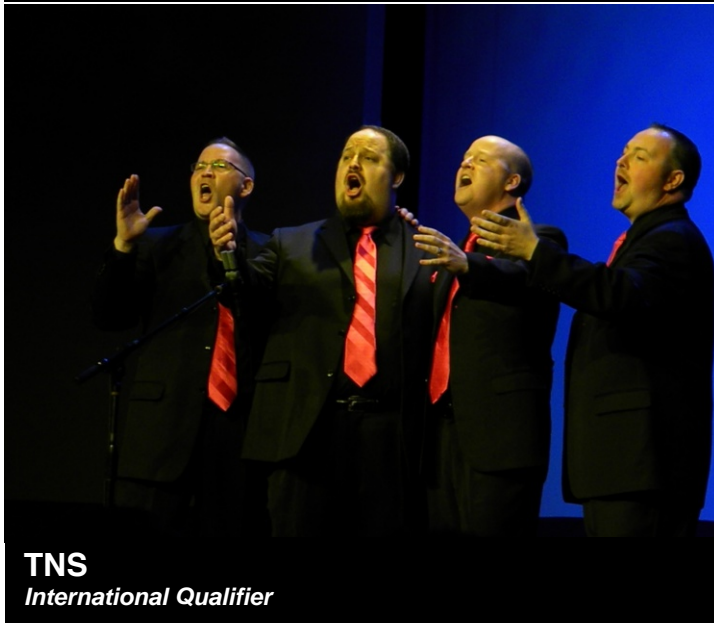
TNS International Qualifier