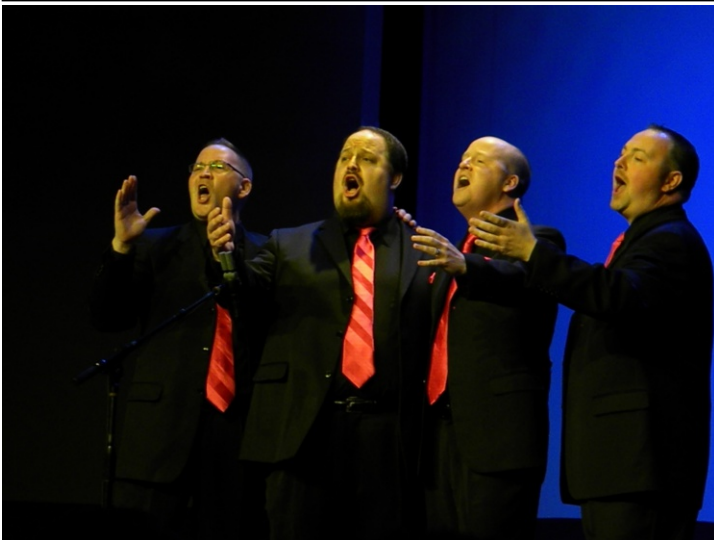
The InsurGents (Collegiate Contest Qualifier)