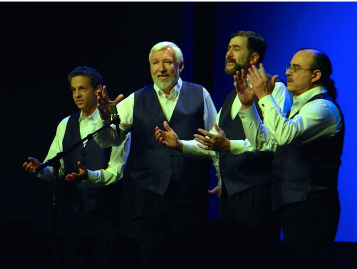
Four Bass Hit