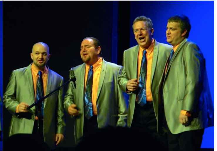
Free and Easy