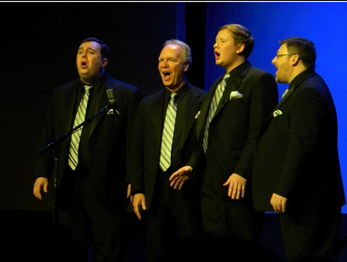
Steel City Four