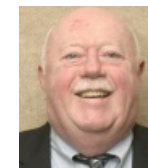
Communications Dwain Chambers