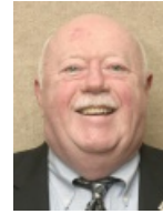
President Dwain Chambers