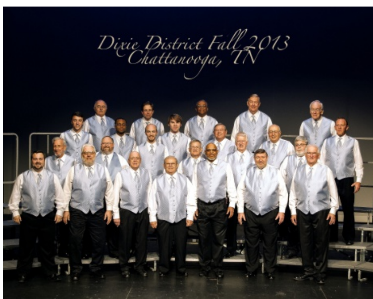
Memphis, TN Memphis Men of Harmony