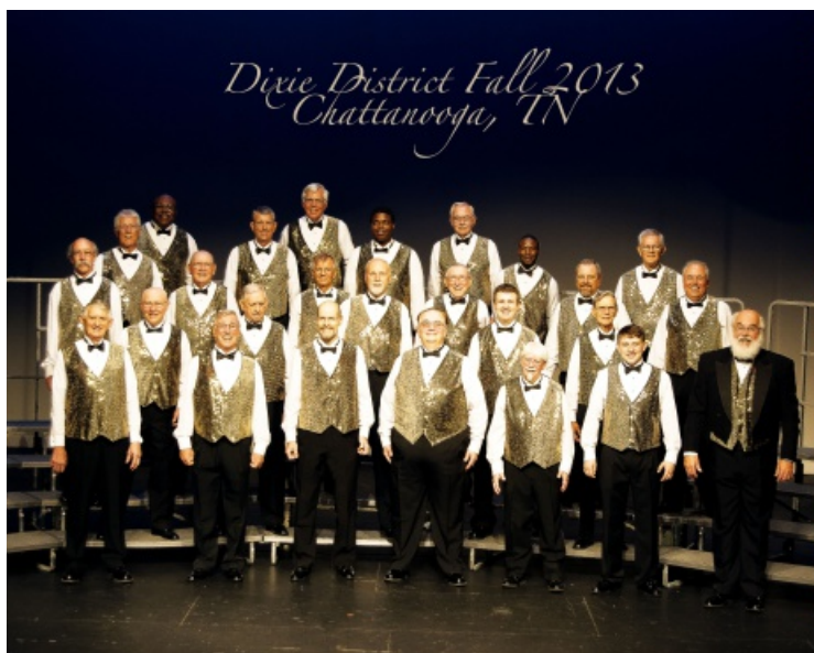
Chattanooga, TN Choo Choo Chorus