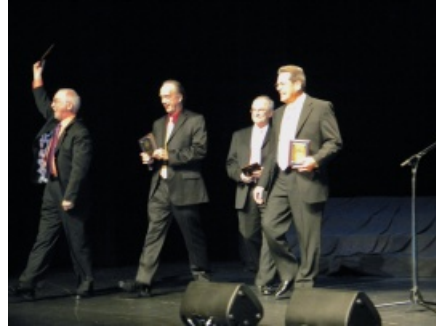
Dino-Chords Senior Quartet Champions