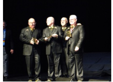
The Stacked Deck Senior International Qualifier