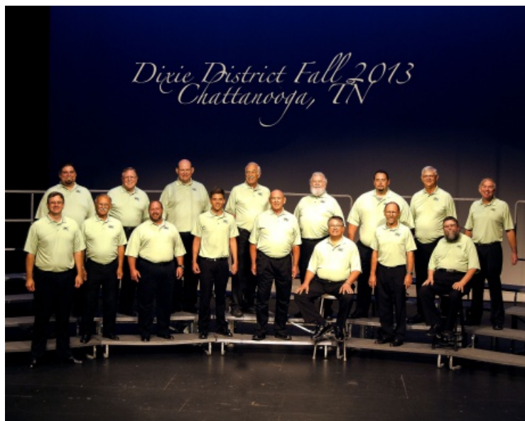
Dixie District Most Improved Chorus