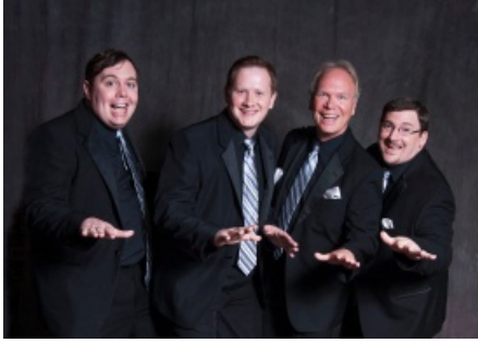
Steel City Four Novice Quartet Champion