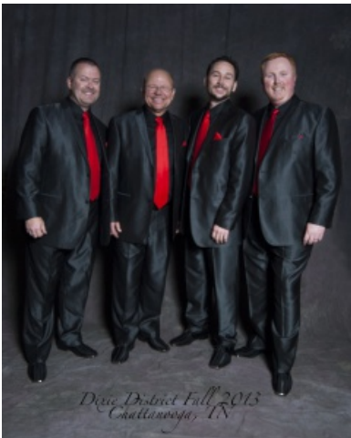
RedZone District Champions