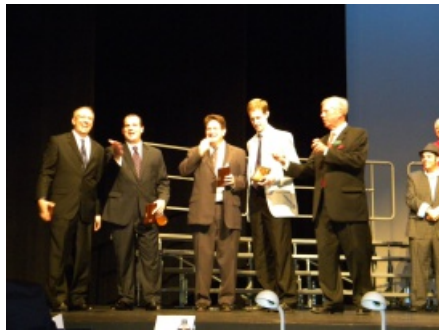
Perimeter Sound 5th Place Quartet