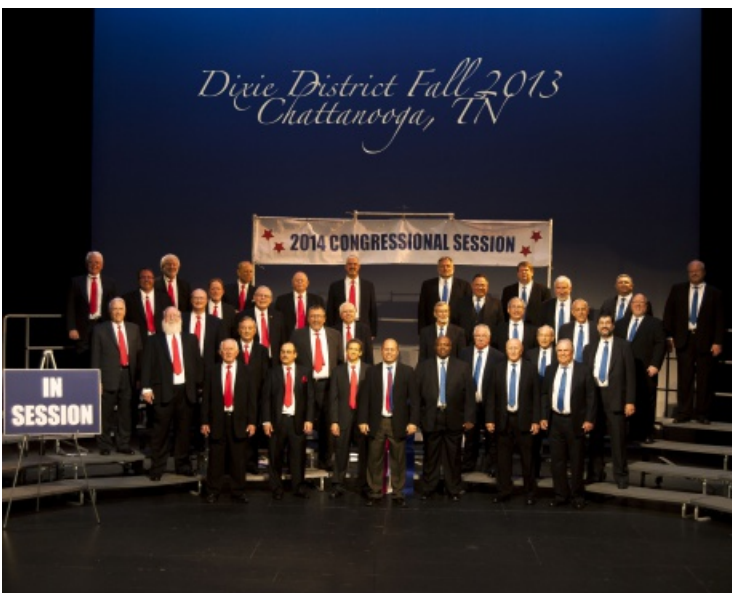
Greater Atlanta, GA Stone Mountain Chorus