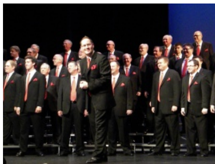
Music City Chorus Nashville, TN International Chorus Qualifier