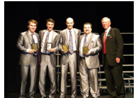
Instant Message 3rd Place Quartet