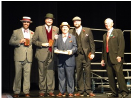
Boardwalk 2nd Place Quartet