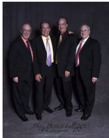
DinoChords Senior Quartet Champions