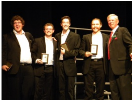
InsurGents 4th Place Quartet