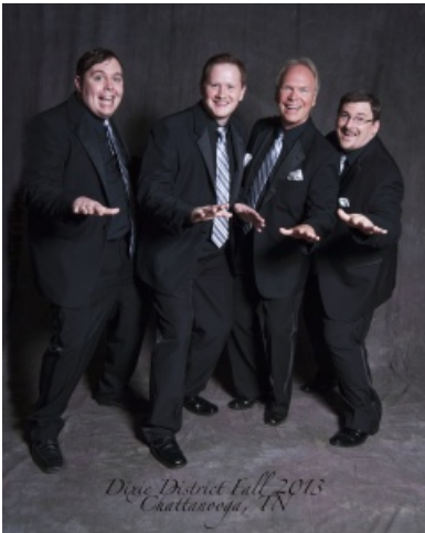
Steel City Four Novice Quartet Champions