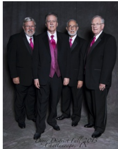
129 & Counting