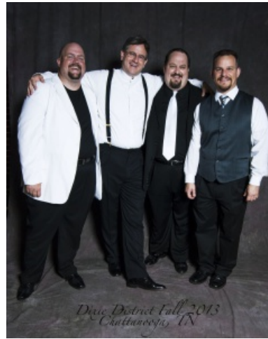
City Cafe House Band