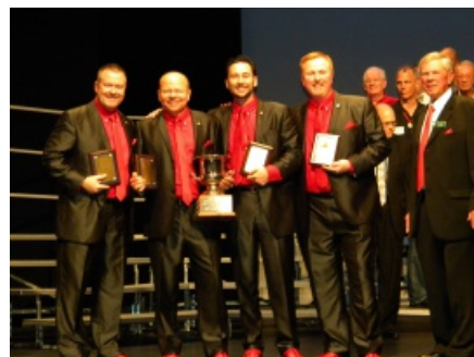
RedZone 2013 Dixie Quartet Champions