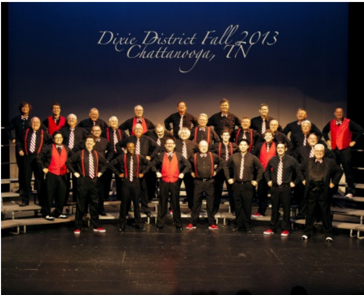
Tuscaloosa, AL Crimson Pride Chorus