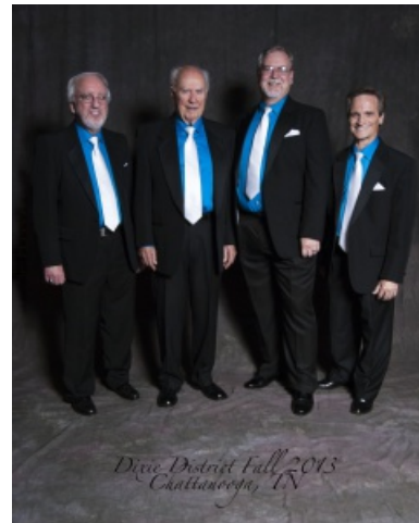
Solid Rocket Boosters