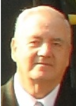
Sherwood Platt Standing Ovation Program

Would your Chorus or Quartet benefit from a Standing Ovation Review?