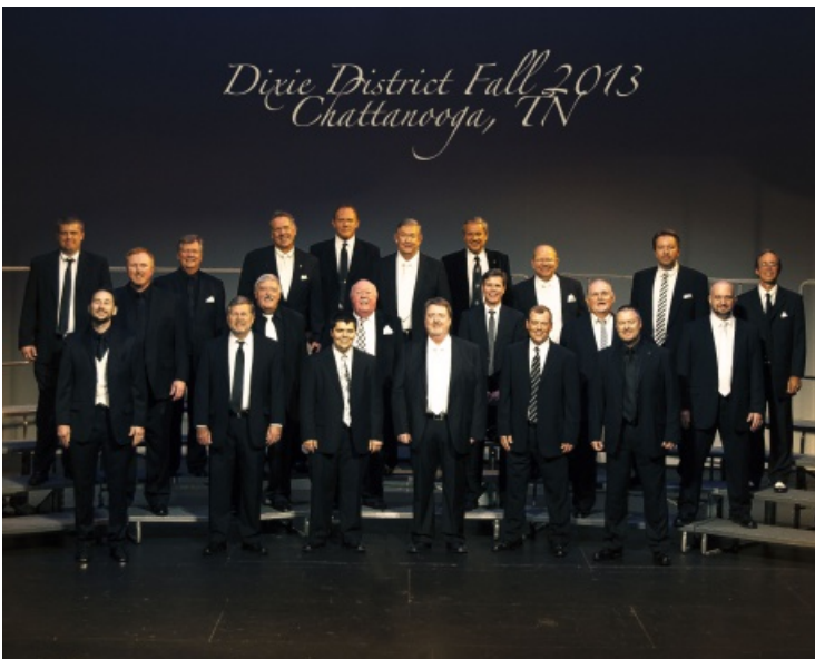
Germantown, TN RSVP