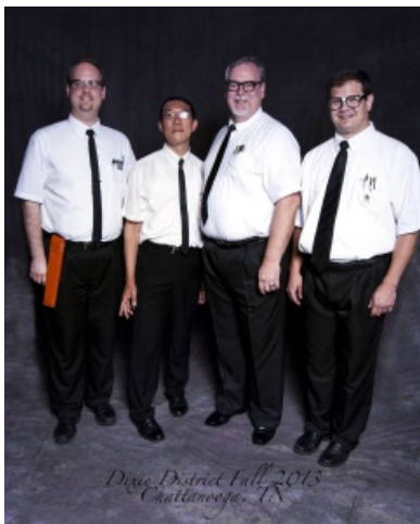
The Slide Rules