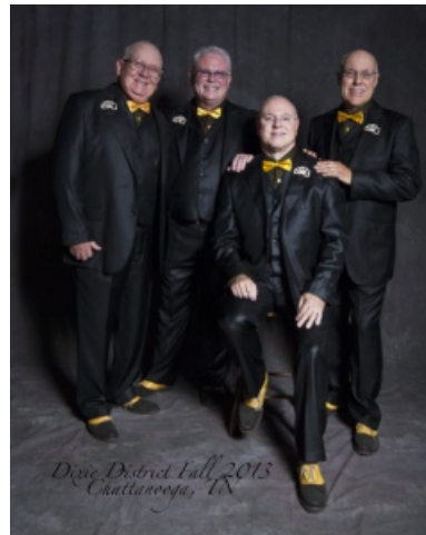
Stacked Deck Senior International Qualifiers