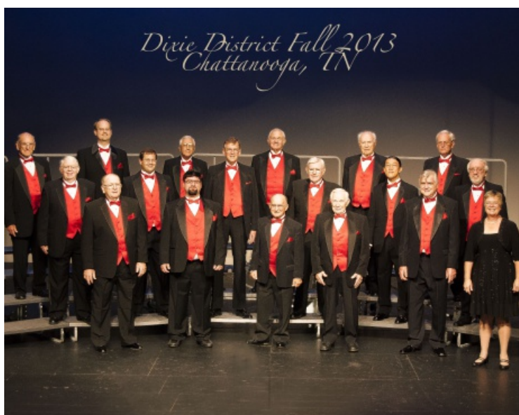
Huntsville, AL Rocket City Chorus