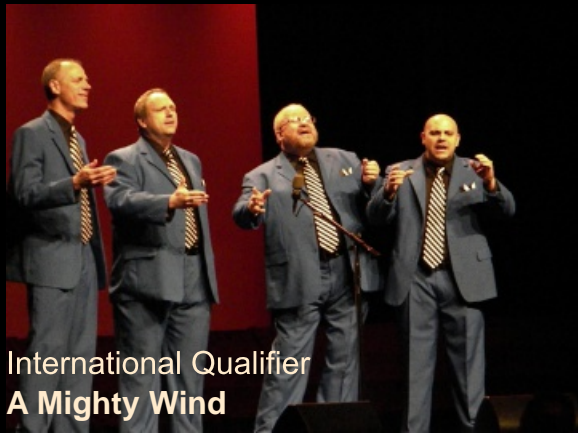
International Qualifier A Mighty Wind