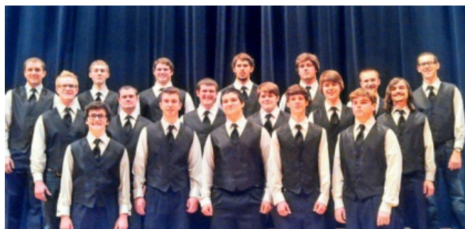
Knoxville's Foothills Sound