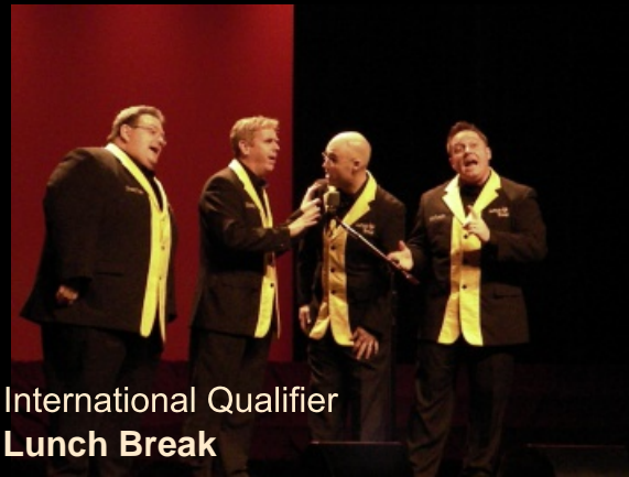
International Qualifier Lunch Break