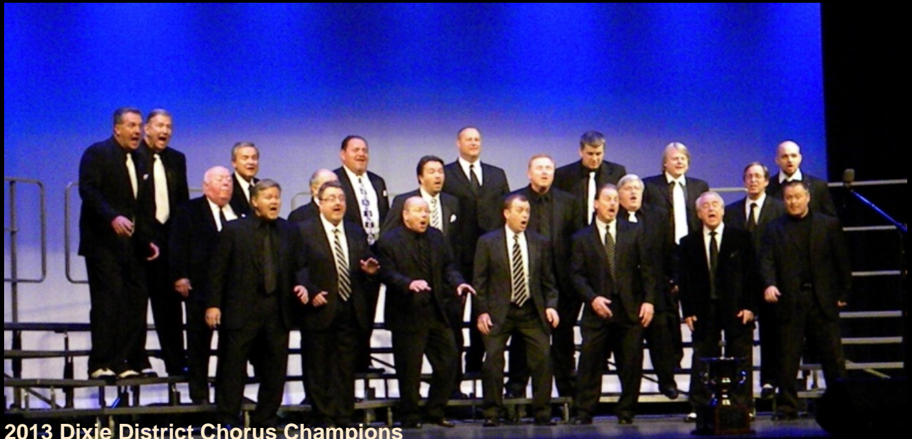
2013 Dixie District Chorus Champions RSVP Germantown, TN