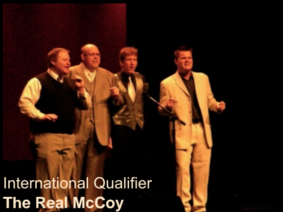
International Qualifier The Real McCoy