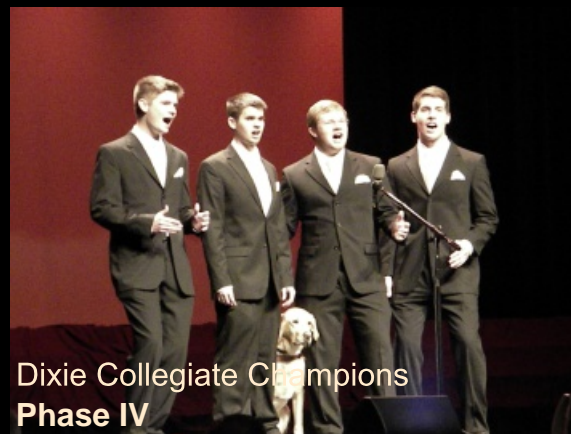
Dixie Collegiate Champions Phase IV Nashville, TN