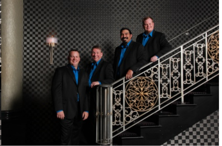
7th and Broadway