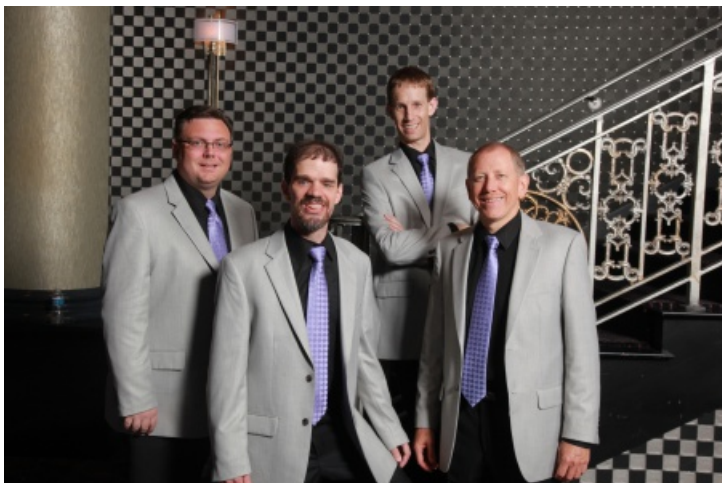
The Angle 2012 Dixie District Novice Quartet Champion