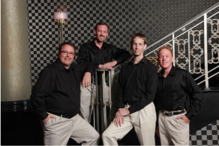
4 Degrees North