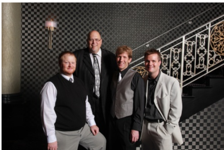
The Real McCoy 2012 Dixie District Quartet Champions