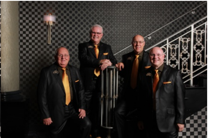
The Stacked Deck Senior Quartet Champions Mid-Winter Senior Quartet Representatives