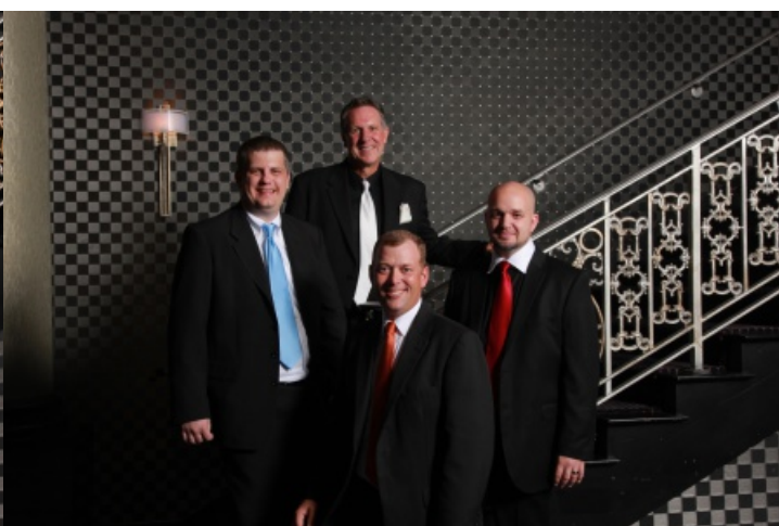
Free and Easy