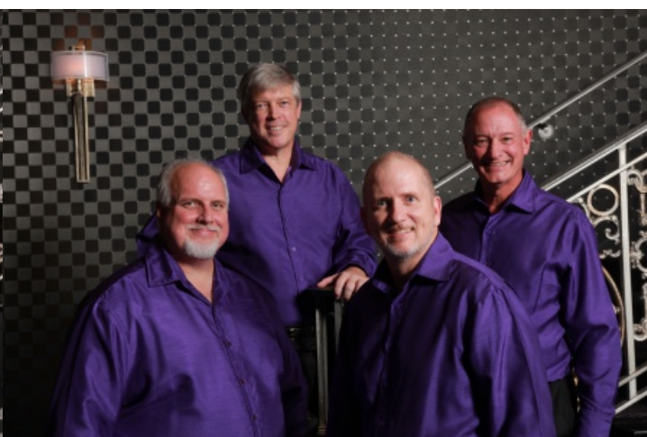
Power of 4