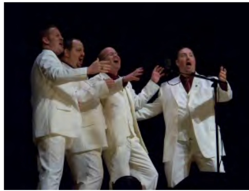
The Nashville Singers, 2008 District Quartet Champs, sing their swan song