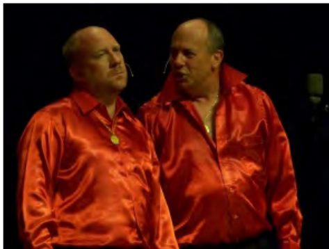
Viva Las Vegas!