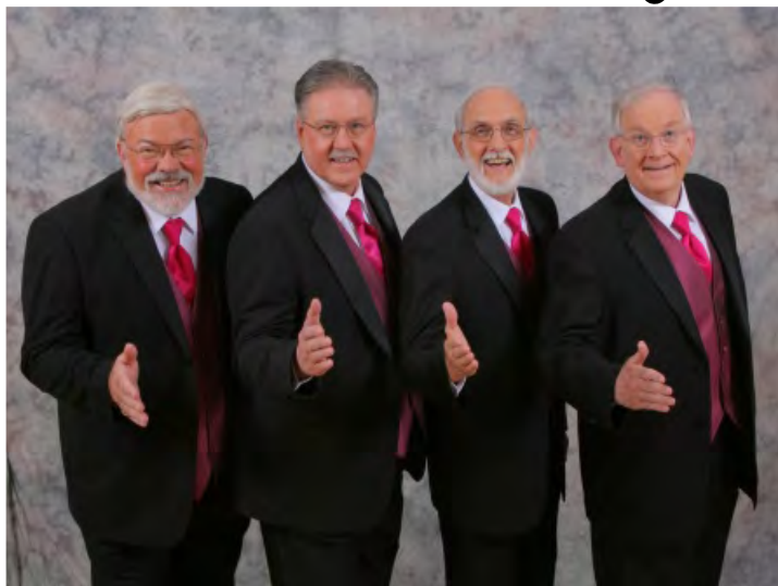
129 & Counting