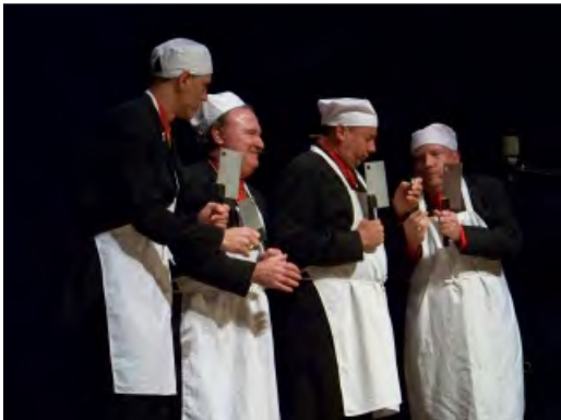
The "Butchers of Harmony" (a.k.a. FRED!)