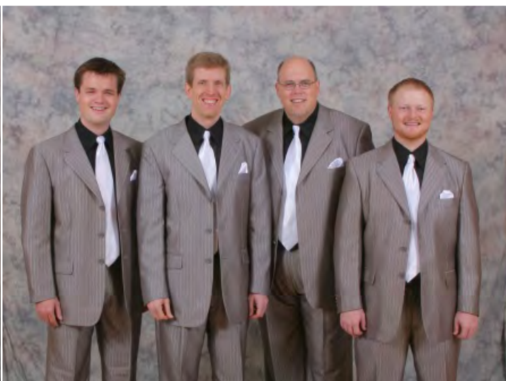
The Real McCoy