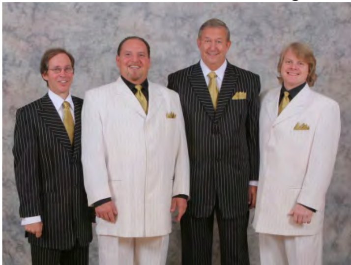
Time and Again