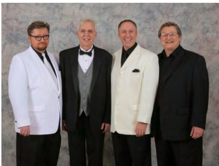
Some Assembly Required