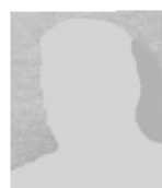
Financial Development open