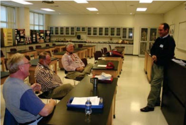
Chorus Director's Class