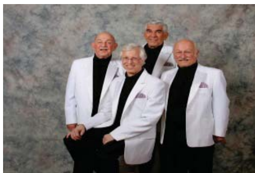
Archives 2008 Seniors Quartet Champions