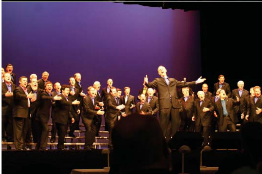
2008 Dixie Chorus International Qualifiers