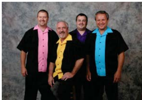
Five 'n Dime