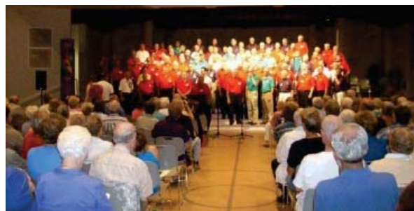
Packed house enjoys the New Bern Mass Chorus