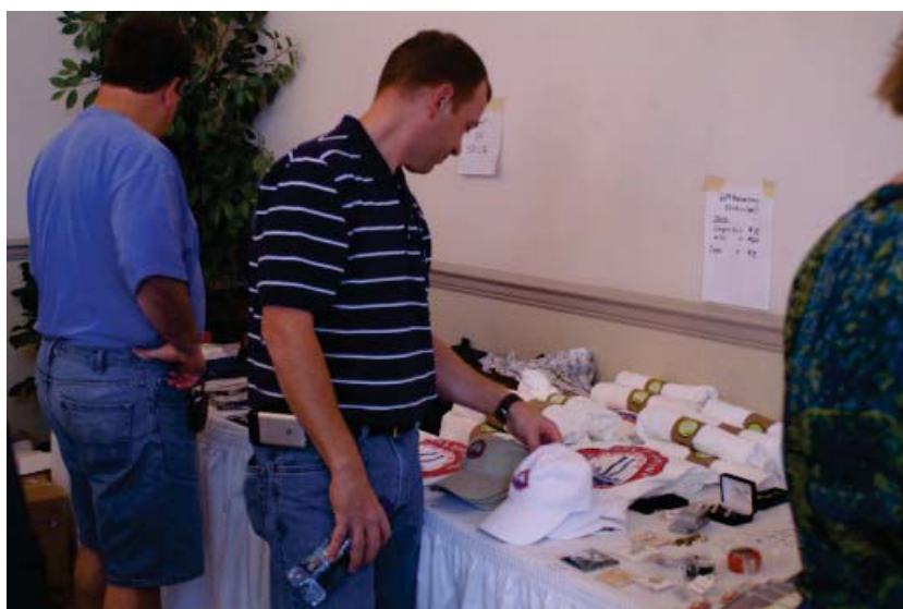
Customers look over the merchandise in the Dixie Marketplace. Scaled-down Marketplaces will continue to be open at District events.