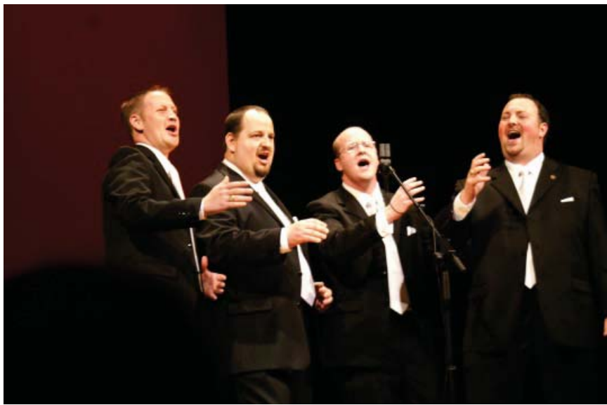
2008 Dixie Quartet Champions The Nashville Singers