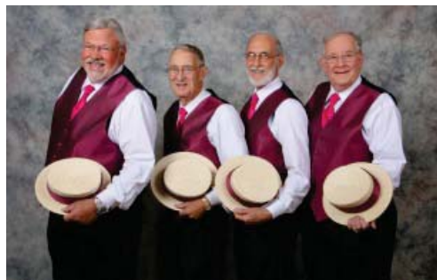
Good Time Singers