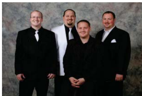
The Nashville Singers 2008 Dixie Quartet Champions