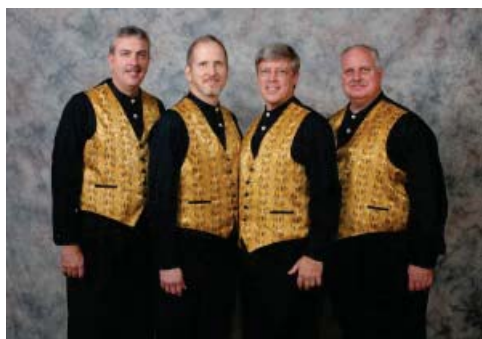
Power of 4