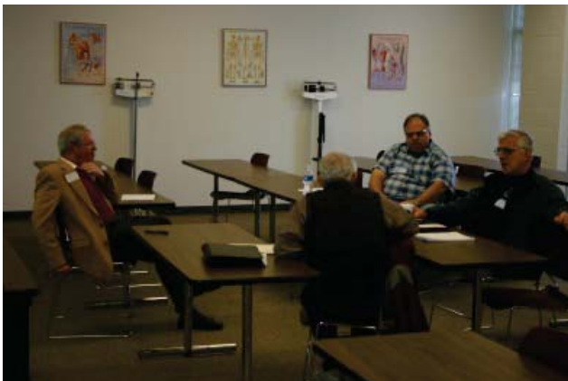
Music & Performance Class