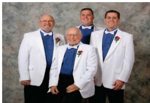
Locked & Loaded