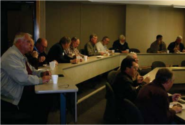
Everyone's Favorite Class -- Chow Time!