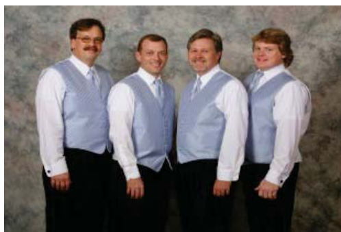
Once In A While 2008 Novice Quartet Champions