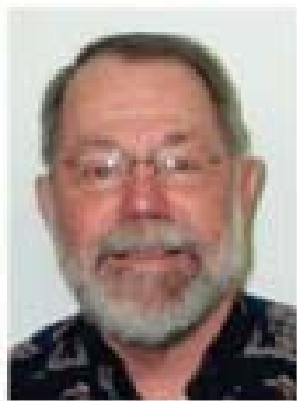
By Dave Millson Chapter Support & Leadership Training

Some of the classes followed the BHS party line while others were very innovative allowing the attendees to discuss what they most wanted to develop/learn in their classes. Both were extremely successful learning techniques and received high ratings on the student evaluations.