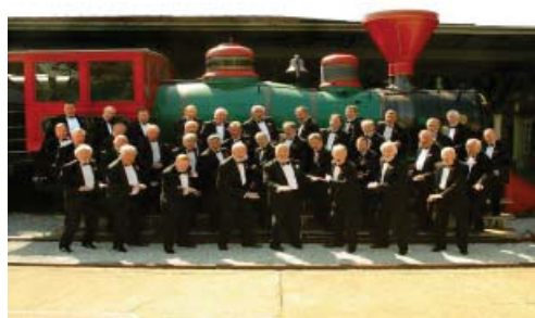
Research Triangle Park, NC