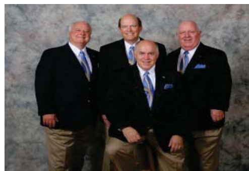
Village Green 2009 DIX International Seniors Quartet Representatives