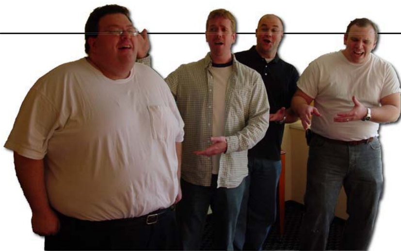
Dixie Quartet Champions, Lunch Break, improve their craft during a Top Gun session.

As I am sure you are all aware, stepping into the competitive arena entails a great deal of time and effort.