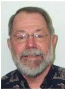
By Dave Millson Chapter Support & Leadership Training

NO! COTS is evolving into the Dixie Leadership Academy . If you attended a Dixie District COTS for the 2007-2008 cycle you should have noticed a difference from the previous traditional COTS. COTS has evolved into a two-hour block for core track instruction, a two-hour block of advanced track instruction, plus a two hour elective: track discussion, joint classes, or mentored planning.