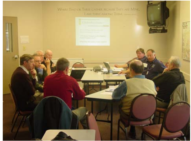
Chapter Development Class

October 15, 2008 so they will have adequate time to clear their calendars for the Dixie COTS-Leadership Academy in your area of the district. Mr. Chapter President, you should appoint your nominating committee NOW and nominees should COMMIT to attend officer training when they accept becoming a candidate for office. See you at the next Dixie COTS-Leadership Academy! 🎵