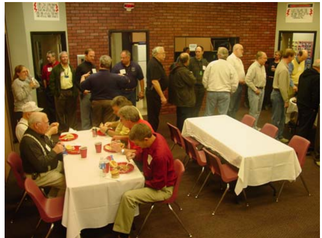
Everyone's favorite class!