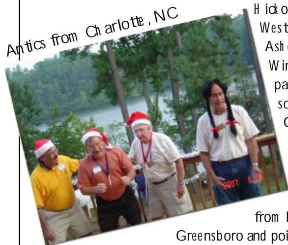
Antics from Charlotte, NC

The gathering had several goals. First and foremost, it had to be a fun event. The special events included the High, Low note contest, the "Lung" contest for the longest note held, the Krazy Quartet Kontest, chorus mass singing on several songs common to most chapters, registered quartet performances, singing (and non-singing) cruises on Lake Hickory, woodshedding, and tags. The performing quartets included Prism, Antics and TBD.