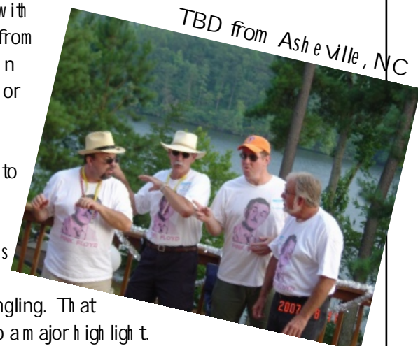
TBD from Asheville, NC

We wanted to get the various choruses mixing and mingling. That was also a major highlight.