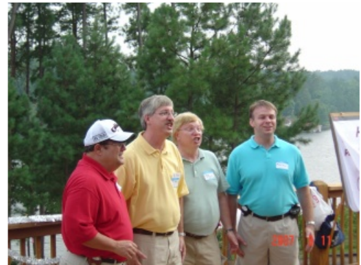
Prism from Everywhere

By far the most popular event was the Krazy Quartet Kontest. With total irreverence for any known judging standards, six quartets had to face the most subjective, undisciplined, unexplained, and unconventional scoring perhaps ever seen at a