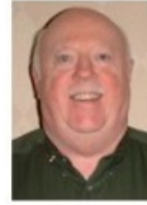
President Dwain Chambers