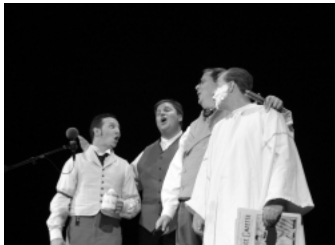
Way Back When