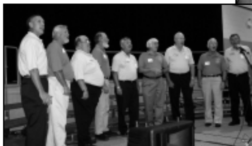
The Edenton chapter, with a little help from New Bern (white shirts) delights the audience. With a 4 1/2 hour drive, Edenton won the distance award.