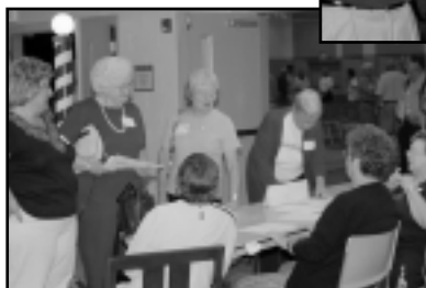
Barbershop wives get information on Wilmington's shopping opportunities