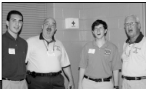
Two Jacksonville and two Wilmington members ring a chord

exposure to a convention-like environment. There is hope that this event will encourage the chapters attending to enter future contests.