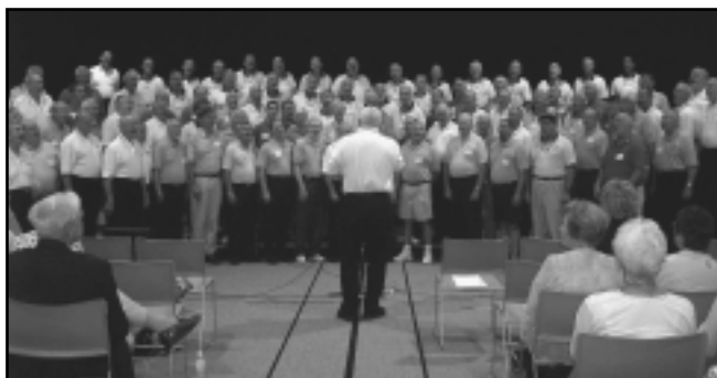
Ninety Eastern Carolina barbershoppers produce a spine-tingling sound

In recapping the event, the Wilmington chapter felt its goals were met. The chapters attending were able to enjoy a gathering of like-minded barbershoppers and were able to experience the thrill of singing in a 90 man chorus. The chapter subsidized the event and everyone feels the investment paid a significant dividend. While no final decision has been made, there is a very strong likelihood that next year's calendar will include the Second Annual Cape Fear Invitational . ~Paul Parker