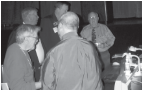
What are all these people doing back here?