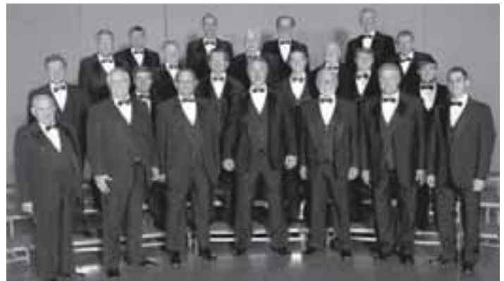
Garden City Chorus, Augusta, Georgia 961 Points