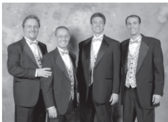
3rd Place Overall Genesis