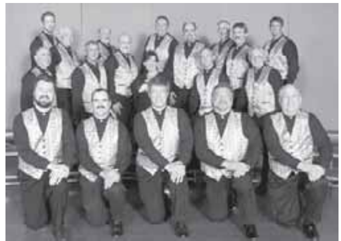
Southern Splendor Chorus, Athens, AL 1024 Points