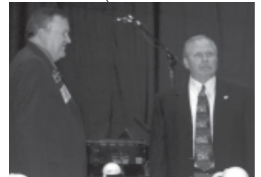
Let's see, who would make a good "Presentation" judge?