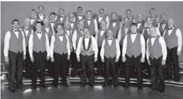
The Appalachian Express, Northeast Tennessee 1045 Points