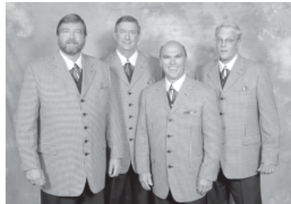
Time And Again