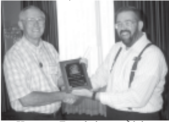
Harmony Foundation top giving chorus, Pinehurst, NC