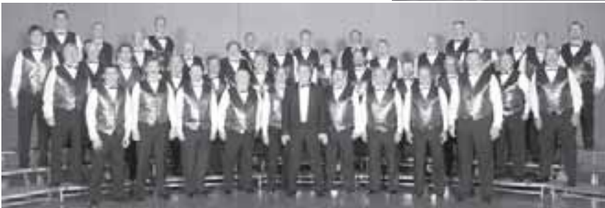
4th Place Dixie District Chorus

Stone Mountain Chorus, Stone Mountain, GA 1363 Points, 75.7 Avg.