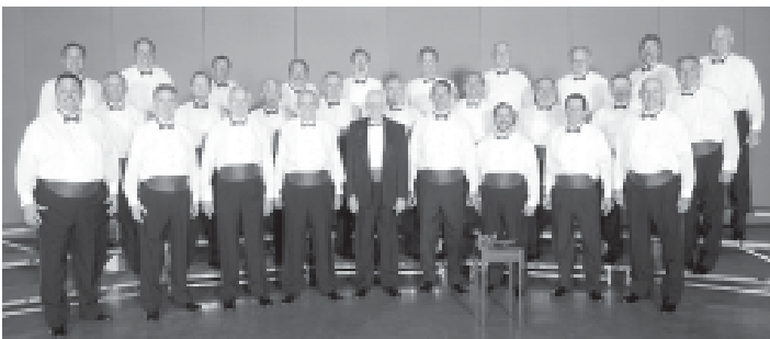
Land of the Sky Chorus, Asheville, North Carolina 1002 Points Points