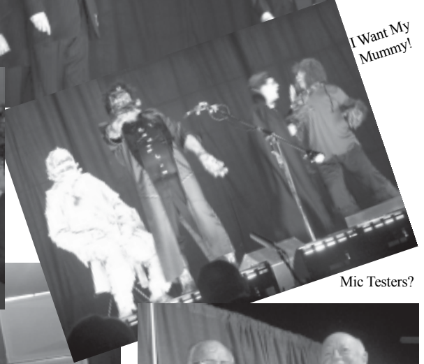
I Want My Mummy!