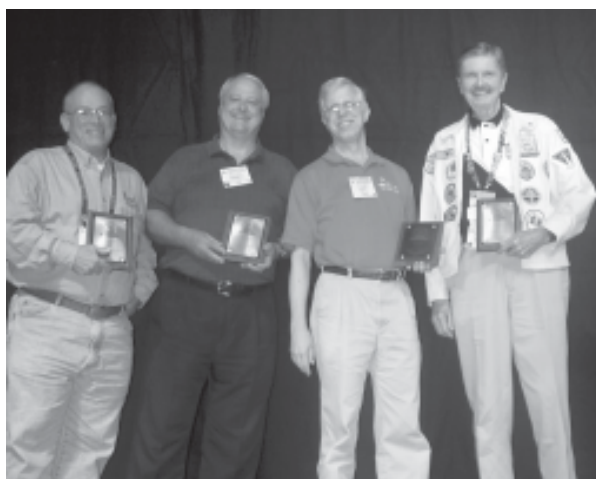
Senior Quartet Champion - Older But Wiser

NOW IS THE TIME TO BE "CHATTING UP" THE MUSIC EDUCATORS IN YOUR JURISDICTION ABOUT THESE FREE EDUCATIONAL OPPORTUNITIES