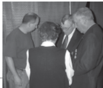
"Do we really want HIM as a judge?"