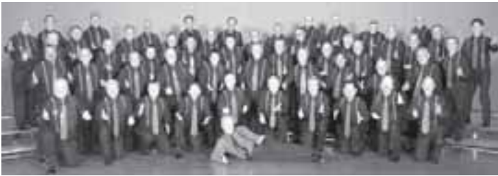
Voices of the South Chorus, Central Alabama 1317 Points