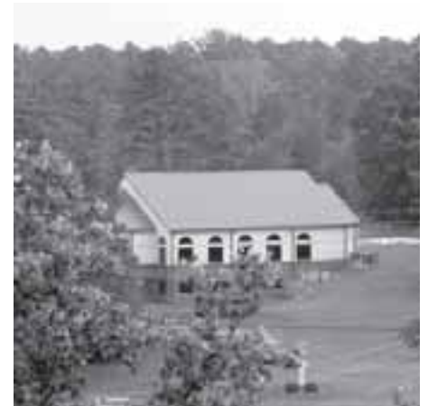
HMMM! This Place Looks Familiar

Imagine our exhilaration as the big balloon lifted us off the ground and we