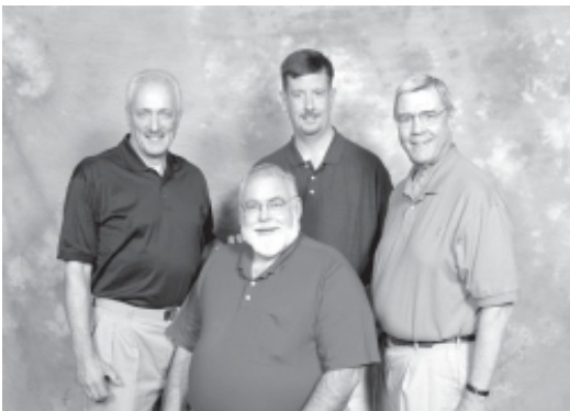
The 4 Porkers