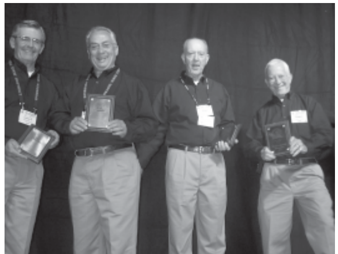
Novice Quartet Winner - Autumn Voices

The next time you see any of the departing and incoming members of your leadership team, give them a solid "barbershop handshake" and thank them for all they do for you.