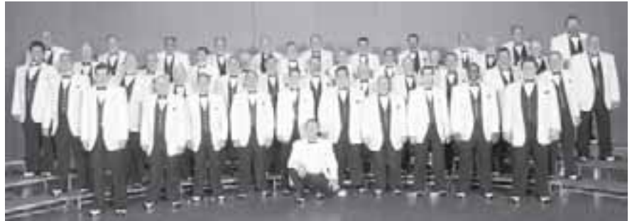
3rd Place Dixie District Chorus