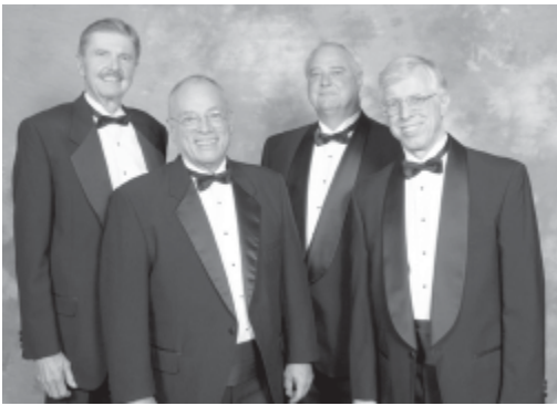
Older But Wiser