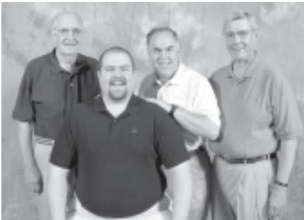
Tune Clippers 905 Points