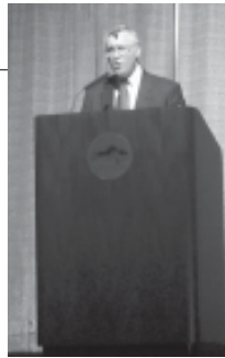
Do we have any order here at all?