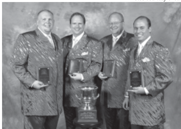
1st Place Overall - Dixie District Champions State Line Grocery