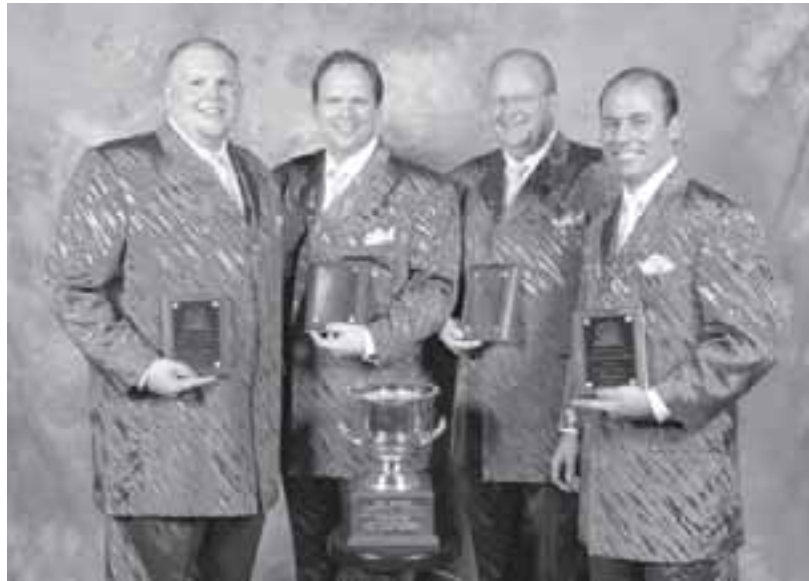
State Line Grocery

PLUS Society Reaches ASCAP Agreement see page 4