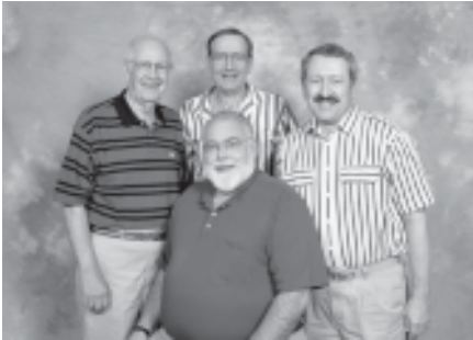
Yipes Stripes 936 Points