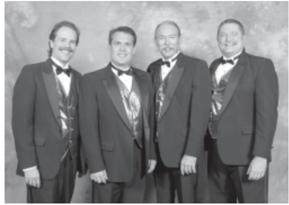
Gentlemen From Georgia