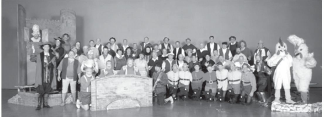
Big Chicken Chorus