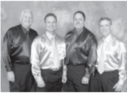
Sound System 945 Points

Marietta once again proved to be the best chorus in these parts with another great contest package. We've all grown accustomed to their super performances