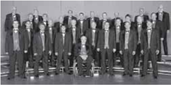
2nd Place Dixie District Chorus Intermediate Chorus Champion

Big Chicken Chorus, Marietta, GA 1471 Points, 81.7 Avg.