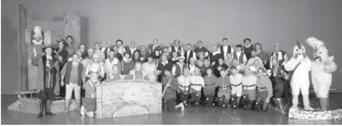
2003 Dixie District Chorus Qualifier & Large Chorus Champion

Big Chicken Chorus, Marietta, GA 1471 Points, 81.7 Avg.