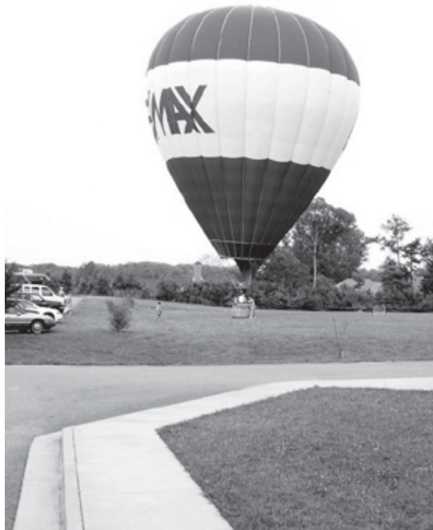
A Picture Perfect Landing Time To Ring Some Chords!

As our flight was drawing to a close our pilot observed that we had traveled more easterly than he had first planned. So