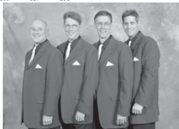
5th Place Overall Tag Team