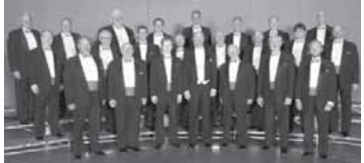
Palmetto Statesmen Chorus, Spartanburg, SC 1091 Points