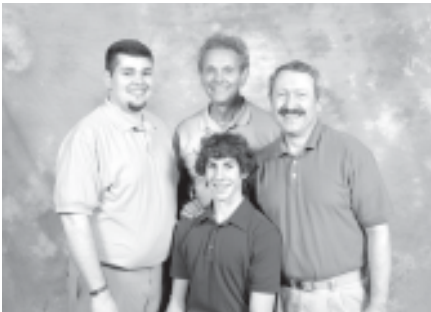
Express Train 935