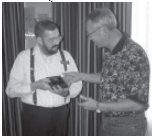
Harmony Foundation top giving quartet, Acapella Fellas