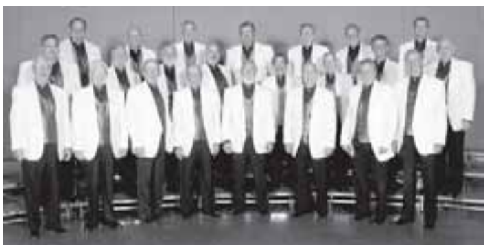
Cape Fear Chordsmen, Wilmington, NC 929 Points