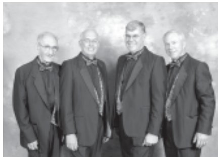
Interstate 4 902 Points