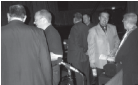
"Can I be a judge? Please--Please!!"