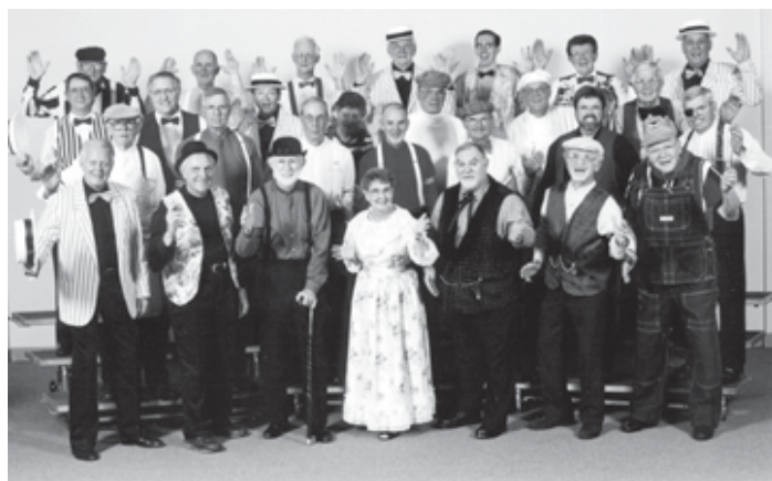
The Golden Corner Chorus Shows Off Their "Gay Nineties" Garb

It's one thing to have perfect pitch and to use it. It's another thing to be able to read music and to use that skill. Yet it's still another thing to be able to simply read the printed word. As barbershoppers, we need to work on all three of these skills, and the Golden Corner Chorus of Seneca, S. C. is currently concentrating on the third skill by working with Anderson Literacy Volunteers, Inc. (ALV) in Anderson, S. C.