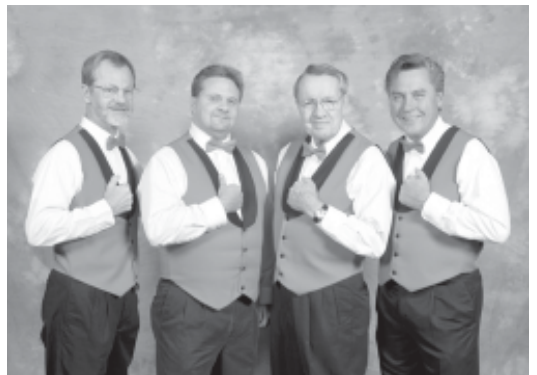
Sounds On Hartwell