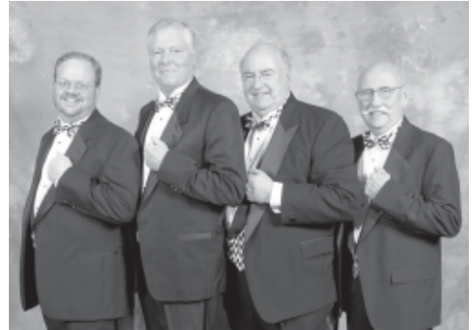
Front Row Center