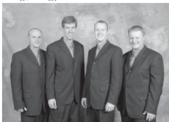
4th Place Overall Smackdown