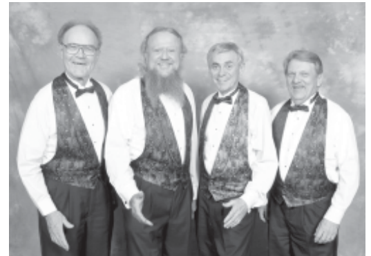
One Ahh Chord