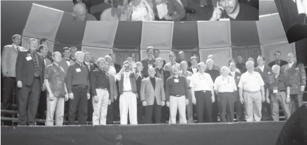
Past Quartet Champions Recognized