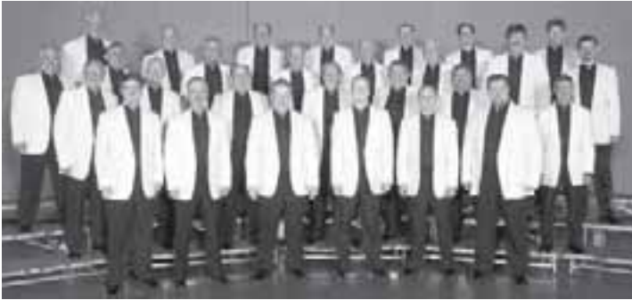
Music City Chorus, Nashville, TN 1206 Points