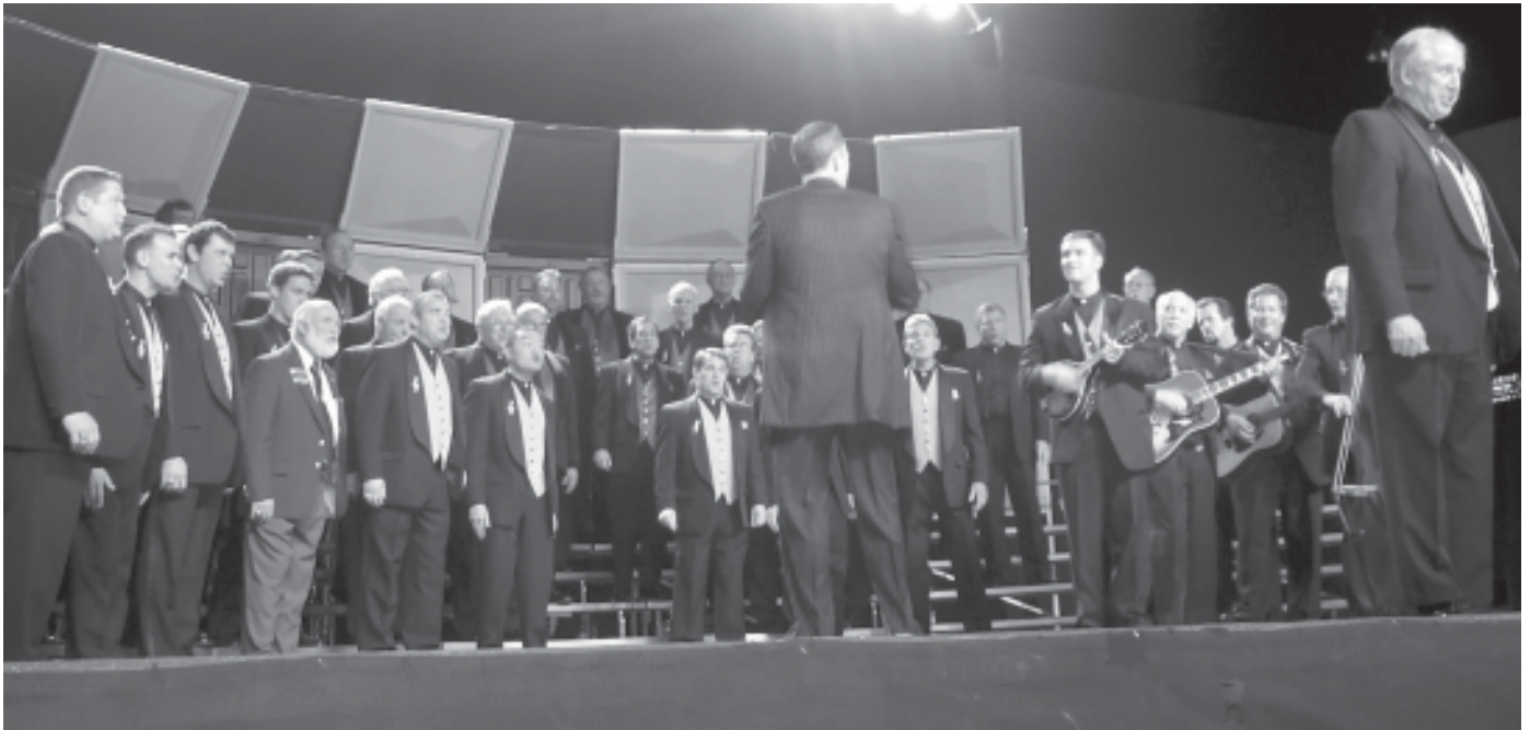
Big Chicken Gospel