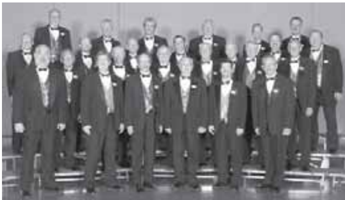
Choo Choo Chorus, Chattanooga, TN 942 Points