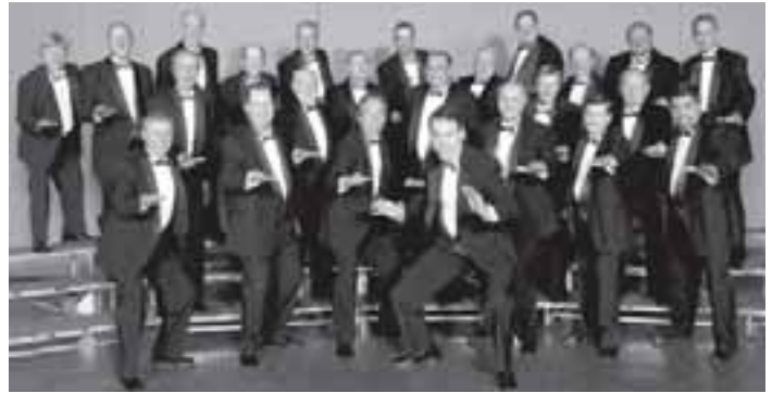
Small Chorus Champion Gold Standard Chorus, Charlotte, NC 1103 Points