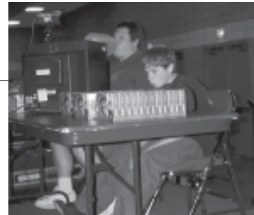
Recording Staff Hard at Work