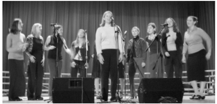
The Demon Divas perform

One high school group of six young men did a "doo-wop" medley. CAPRICE, another high school group of 24 audi-