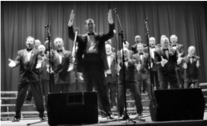
The Triad Harmony Express sings for the Veterans Day celebration

On November 10th at the second annual Veterans Day Show presented by Triad Harmony Express , the Winston-Salem Chapter , presented "A Celebration In Song", featuring seven vocal groups from the Winston-