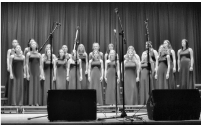
The East Forsyth High School group performs

They invited two high school groups and four college groups to be part of this community songfest. Most of the singing