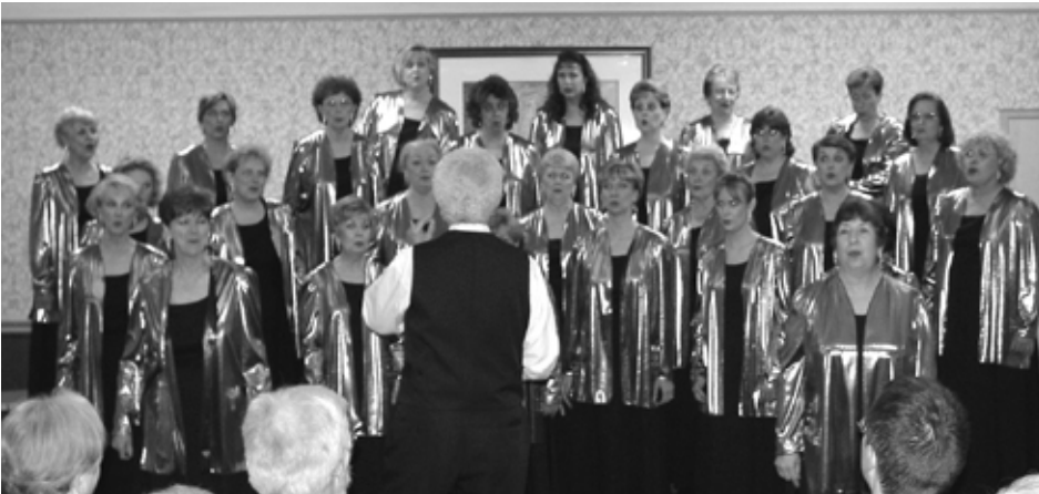
There was some terrific singing by Georgia Connection

Sunday morning, it's back to the classroom at 8:00 am until noon for the rest of the formal training. The sessions were