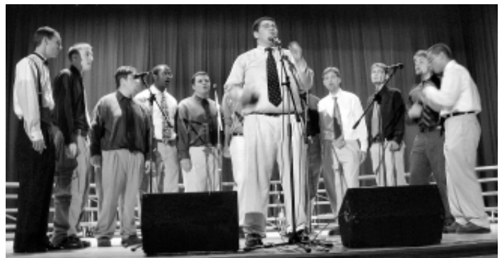
The Spartones entertain

tioned young women, has a strong record in state level competitions and performed music of their time. One Accord and Demon Divas , both female groups from Wake Forest University, were very entertaining. One Accord sang christian music and Demon Divas performed secular numbers. The Spartones from the University of North Carolina at