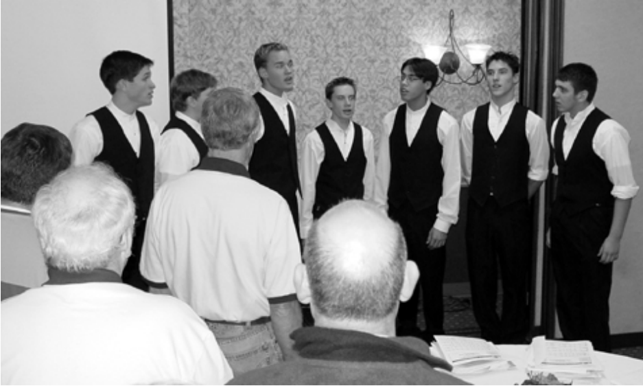
Attendees were entertained in the barbershop style by a high school group