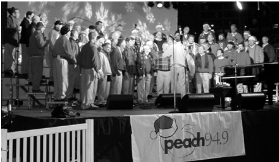
The Big Chicken Chorus performing at the Peach 94.9 Carols in the Park celebration