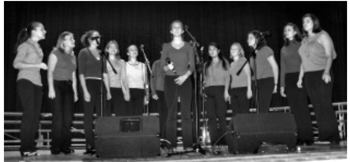
The group known as "One Accord"

tioned young women, has a strong record in state level competitions and performed music of their time. One Accord and Demon Divas , both female groups from Wake Forest University, were very entertaining. One Accord sang christian music and Demon Divas performed secular numbers. The Spartones from the University of North Carolina at