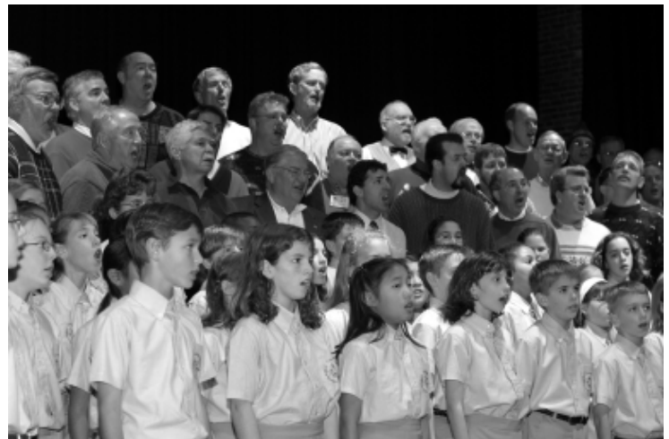
The Big Chicken Chorus performs with the 5th grade Honors Choir in Columbia, MO