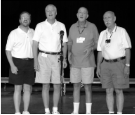
the "Leggs"? quartet performs

and evaluation of the classes, coaches, general sessions, show format, and overall satisfaction. Responses are still coming in, but there is already a pattern of consensus