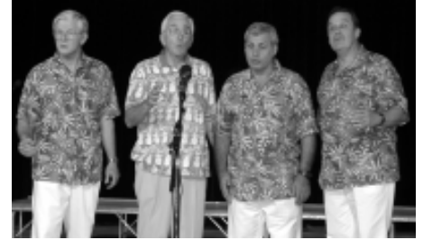
one of these things is not like the other