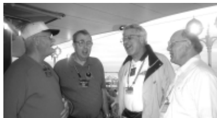
Yours Truly helps serenade a passenger even before we left the dock in Seattle

As you would expect, singing was at its peak. We had no more than unpacked our clothes and headed out to explore the ship when I ran into three other barbershoppers looking for a baritone so they could sing to one of the passengers. Already, this was exciting, and we hadn't even left the dock!