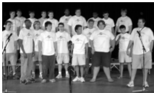
The youth chorus performed as well