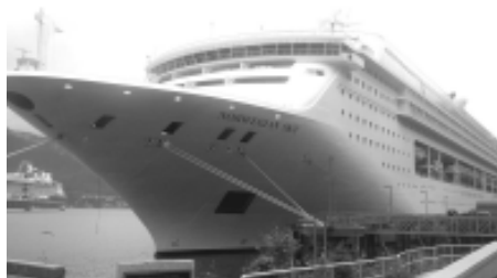
The Norwegian Sky as seen from off her bow in Juneau