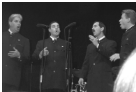
Roll over Beethoven, Gas House Gang is here!