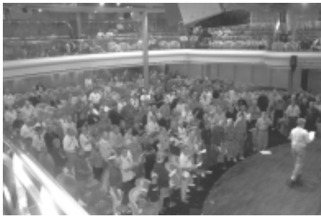
The chorus rehearses for the show

Our 6 th day was spent, in part, in Ketchikan and many of us enjoyed the tour to the totem village. (A lot of Indian history here) We also had our final chorus rehearsal prior to our scheduled Saturday show, and we were all wondering if we would fit on stage. After all, I counted 153 singers.