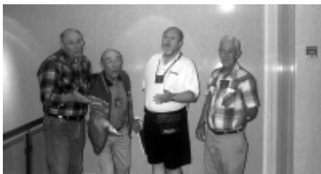
A pickup quartet rehearses for the contest. I swear Sparky Anderson was there! (R)

It was then that I had the experience of