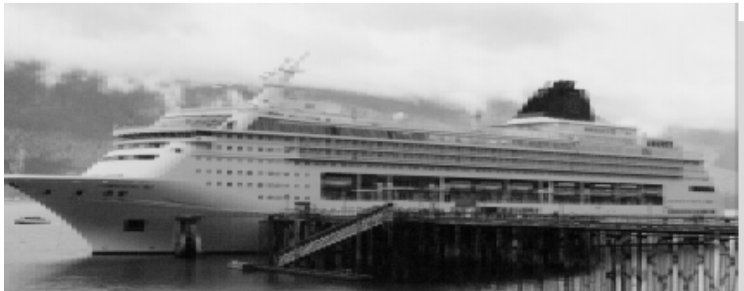
The Norwegian Sky at the dock in Haines, AK