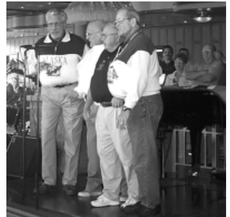
Yours truly with Fat Free Four and their parody on Down Our Way