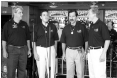
One of our many treats we had when the Gas House Gang sang to us