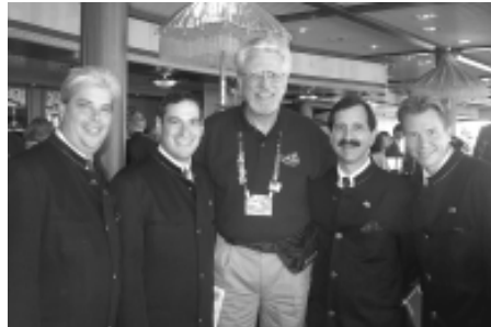
How can one guy be so lucky! Yours truly gets to sing with the Gas House Gang Are they really that short, or was I standing on a box?

knockout! The 1,000-seat showplace was packed. Gas House Gang put on another of their spectacular performances, to include Beethoven, and the 150 plus singers on stage put on an admirable performance.