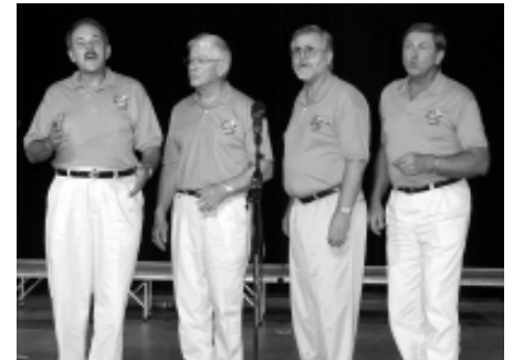
Hmm! there must have been some quartet singing this weekend.

One of the really interesting features of DLHW 2002 was the change in format featuring TWO shows, one open to the public, and one exclusively for the school attendees. Due in part to restricted availability of the venues, the "big show", open to the public and featuring our newly crowned International Champion Four Voices , International Medallist Riptide , Semi-finalist Overture , District Champion CRE-SCENDO , and the Central Alabama Chorus , was held on Friday evening.