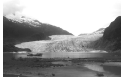
The Mendenhall Glacier from about 1/4 mile

Juneau provided all of us the opportunity to visit the first glacier (Mendenhall), and what an experience. One doesn't realize the sheer magnitude of a glacier until they see it firsthand. Even then, from a distance, your