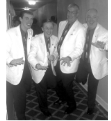
CRESCENDO kicks up it's heels All the gold is NOT in California!