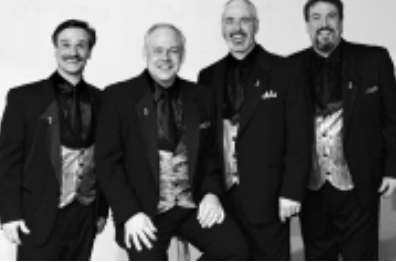
OH.... so close for Spectrum