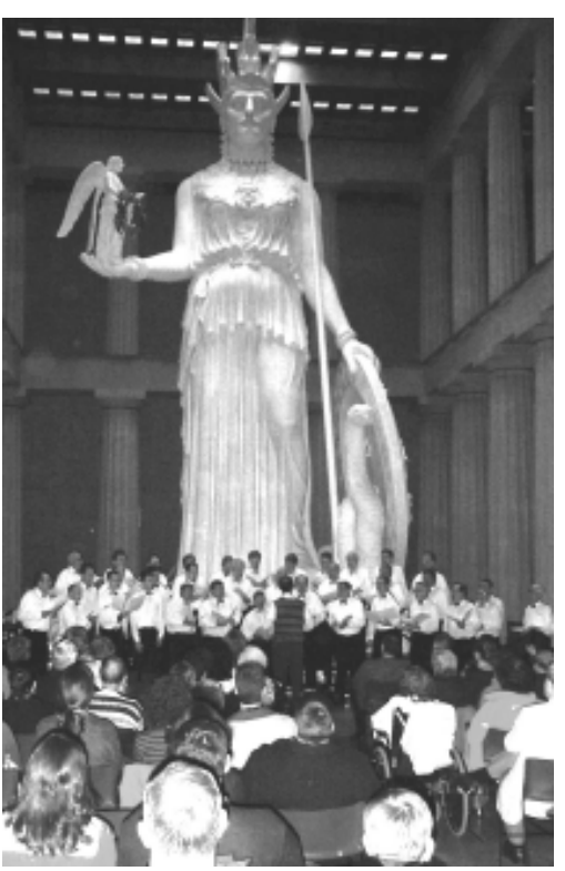
Singing Christmas songs at the foot of a "Graven Image"?

That was a great prelude to our performance the next morning at the Re naissance Hotel Grand Ballroom (where last summer's Collegiate Quartet Championship and the Chorditorium