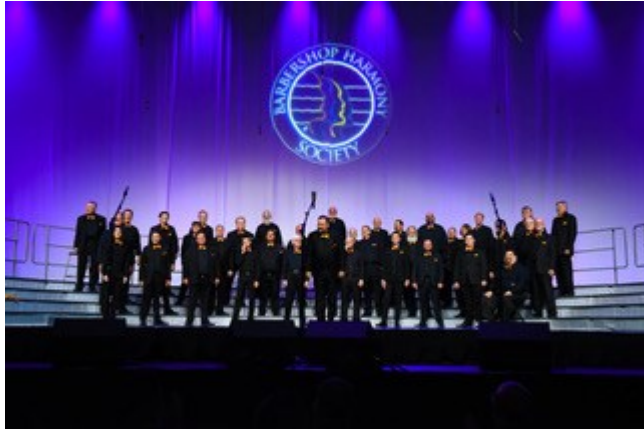
Sound of Tennessee